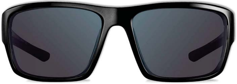
Goggles for Visually Impaired Persons