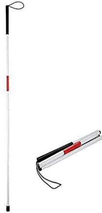
Reflective Folding Sticks for Visually Impaired Persons