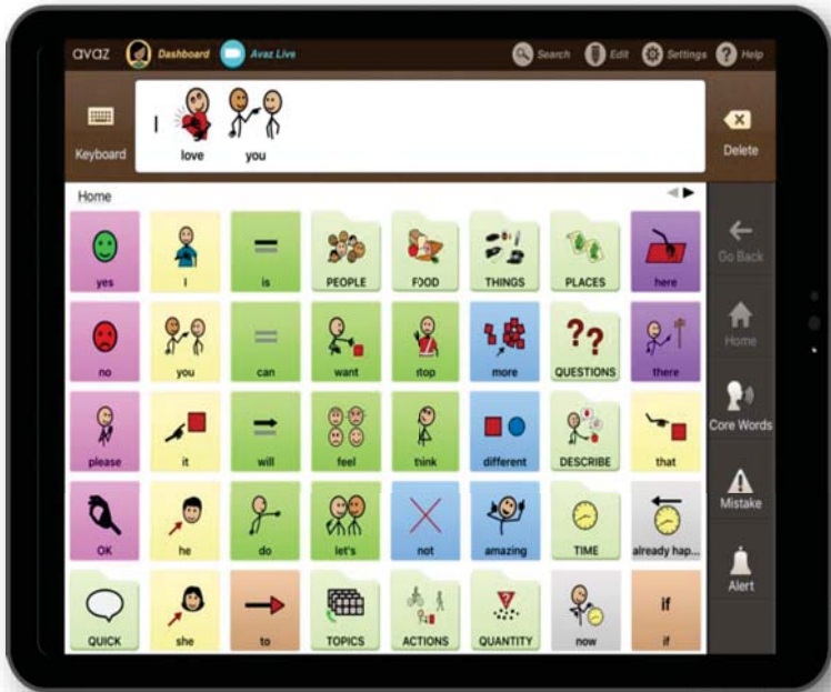
Augmentative and Alternative Communication System (AAC) Device with Avaz Software