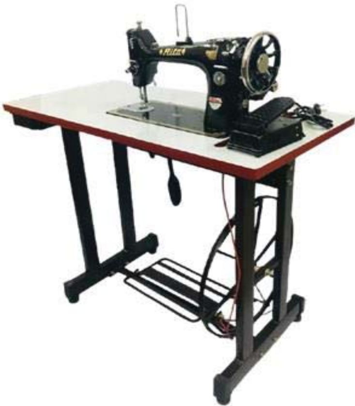
Motorized Sewing Machine