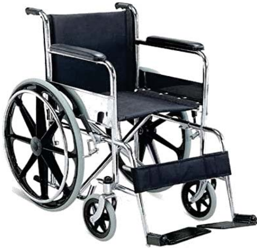
Foldable Wheel Chair