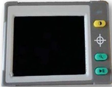
Magnifier for the Persons with Low-vision