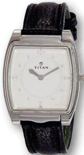
Braille Watch for Visually Impaired Persons