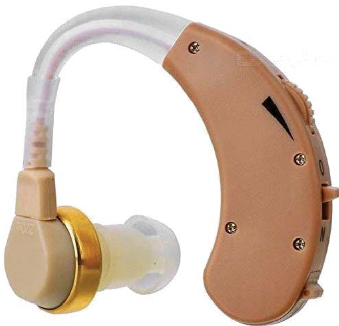
Behind the Ear Hearing Aid