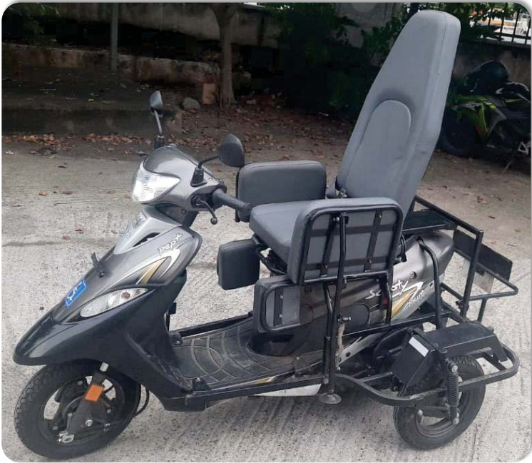
Specially Designed Retro-Fitted Petrol Scooter for Spinal Cord affected persons