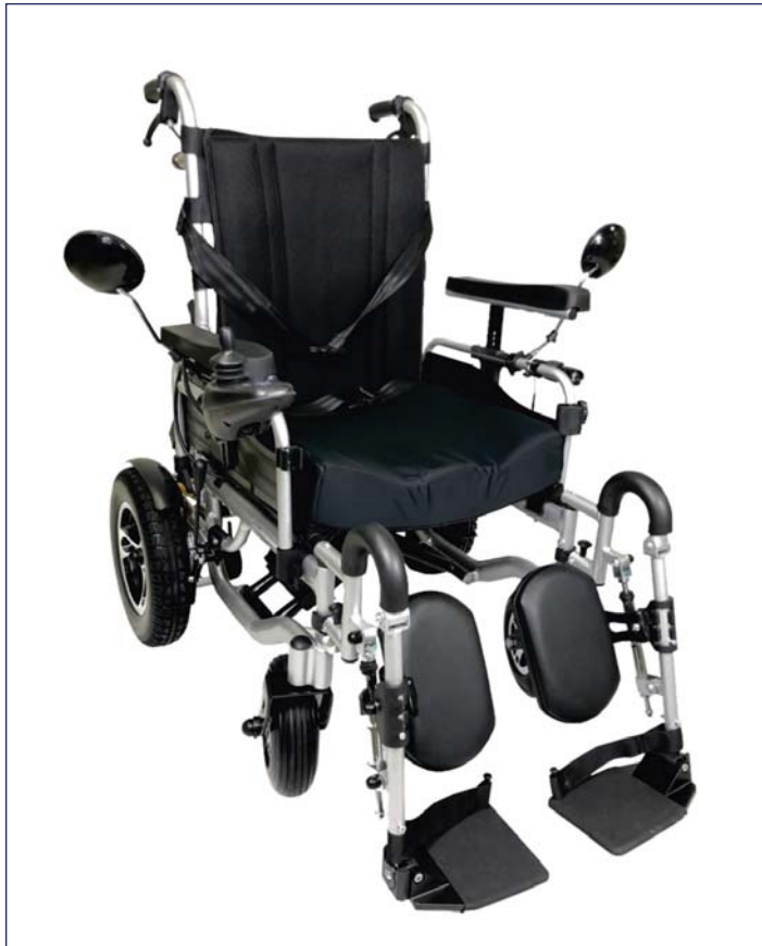
Battery Operated Wheel Chair for the person affected with Muscular Dystrophy and Spinal Cord Injury