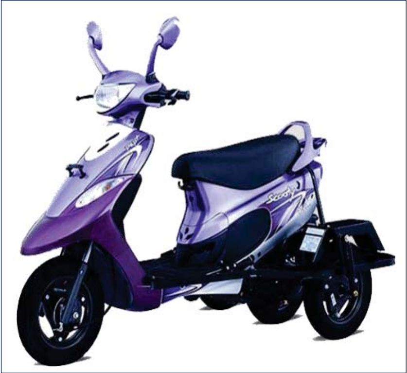
Retro-Fitted Petrol Scooter