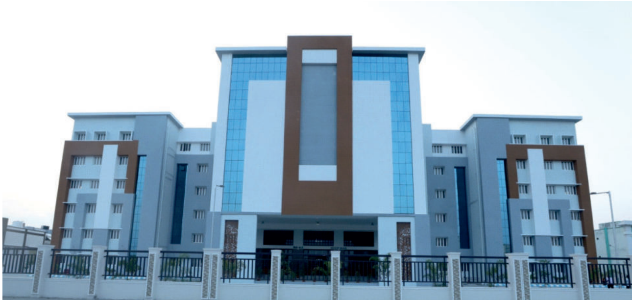
Kallakurichi Government Medical College – Institution Inaugurated on : 12.01.2022