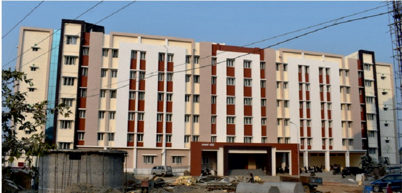
Kallakurichi Government Medical College –Student Hostel (Boys) Inaugurated on : 12.01.2022