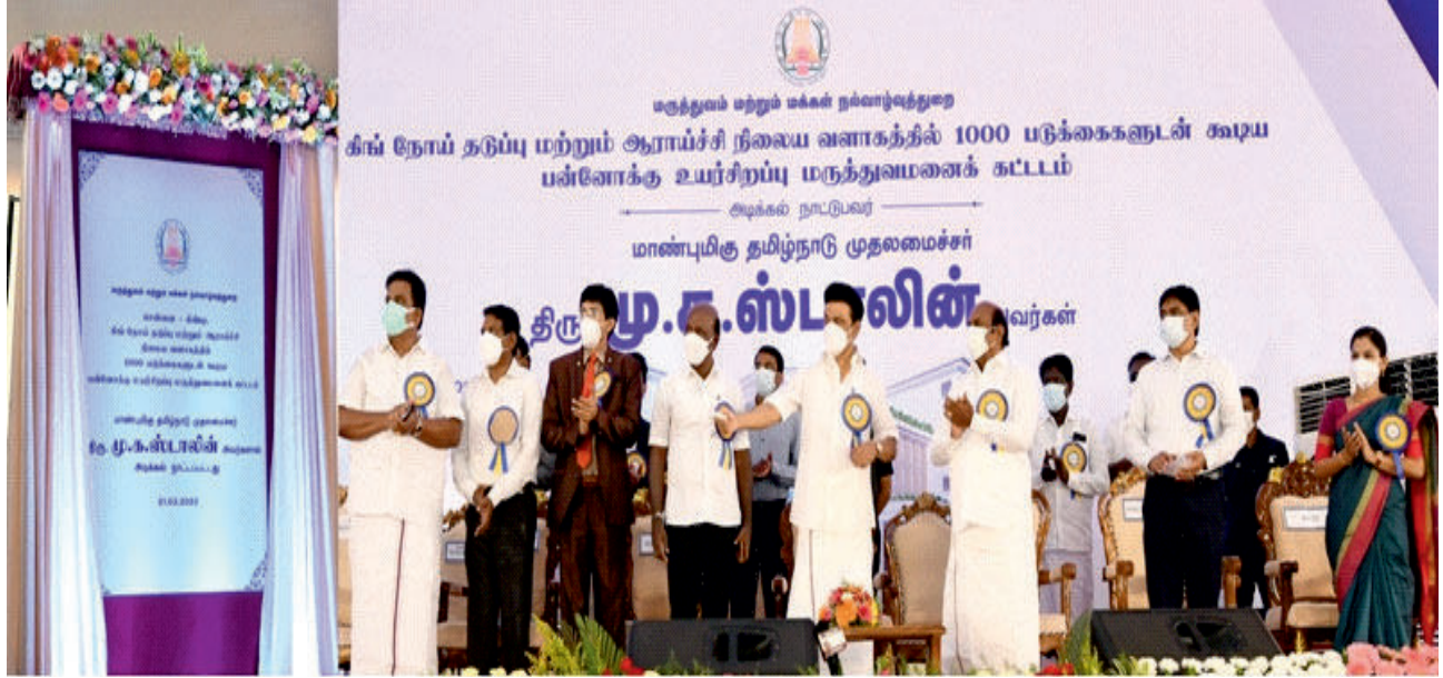
The foundation was laid for the Multi Super Speciality Hospital , Guindy, Chennai at an estimated cost of Rs.230 Crore in the premises of Kings Institute of Preventive Health & Medicine on 21.03.2022 by the Hon'ble Chief Minister of Tamil Nadu Thiru.M.K.Stalin through Video Conferencing.