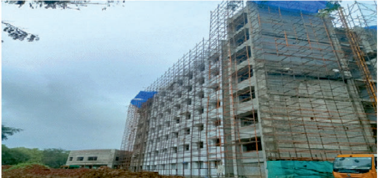
Construction of District Collectorate in Tirupathur