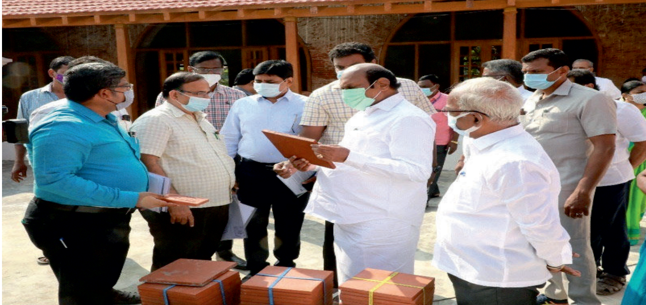
Inspection was carried out by the Hon'ble Minister for Public Works at the site of Fire affected and distressed 'Humayun Mahal ' Heritage Building Renovation Work at Chepauk in Chennai