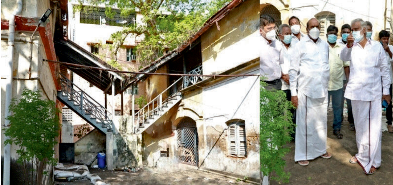
Inspection was carried out by the Hon'ble Minister for Public Works at Registrar Office at the Sowcarpet, Davidson Road, Chennai