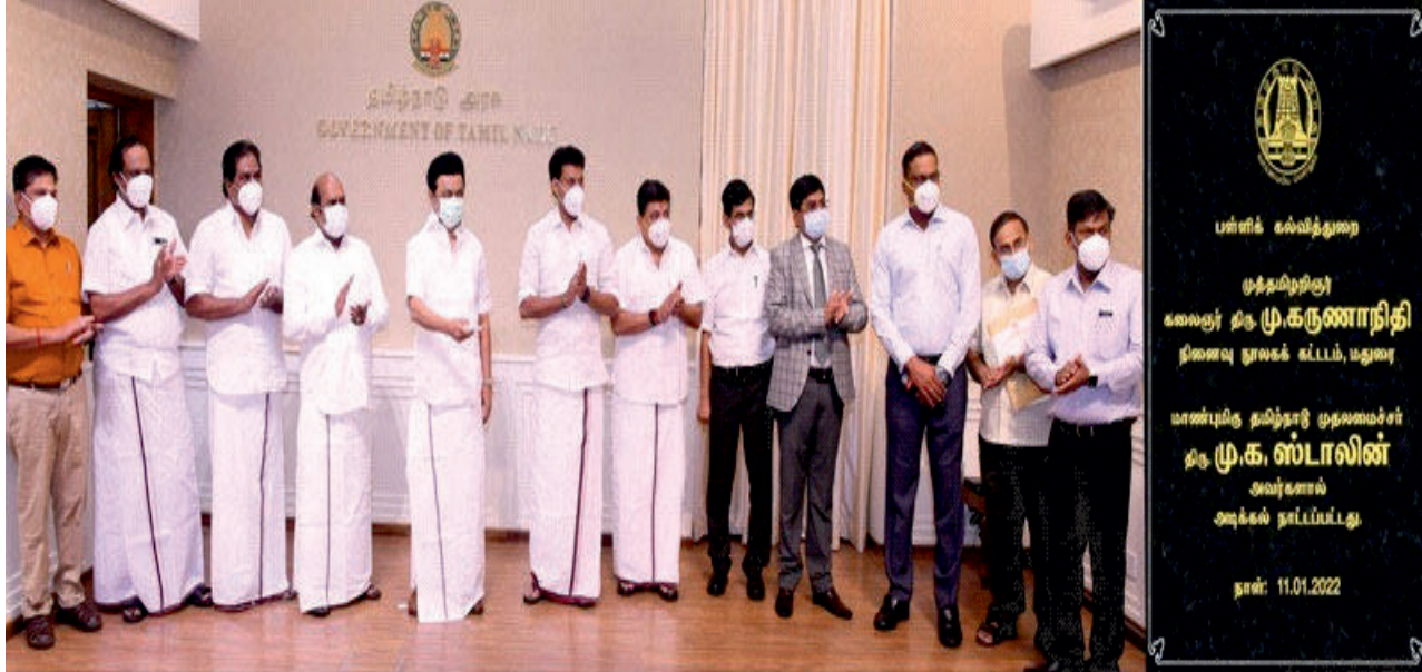
The foundation was laid for the Kalaingar Memorial Library , Madurai on 11.01.2022 by the Hon'ble Chief Minister of Tamil Nadu Thiru.M.K.Stalin through Video Conferencing at Secretariat