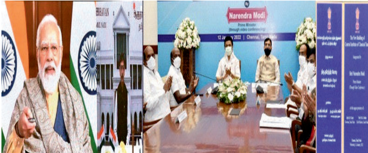
Newly constructed 11 New Medical Colleges at a cost of Rs.4080 Crore was inaugurated by the Hon'ble Prime Minister of India in the presence of the Hon'ble Chief Minister of Tamil Nadu through Video Conferencing at New Delhi