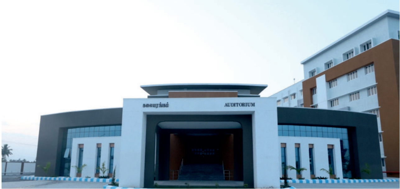
Kallakurichi Government Medical College – Auditorium Inaugurated on 12.01.2022