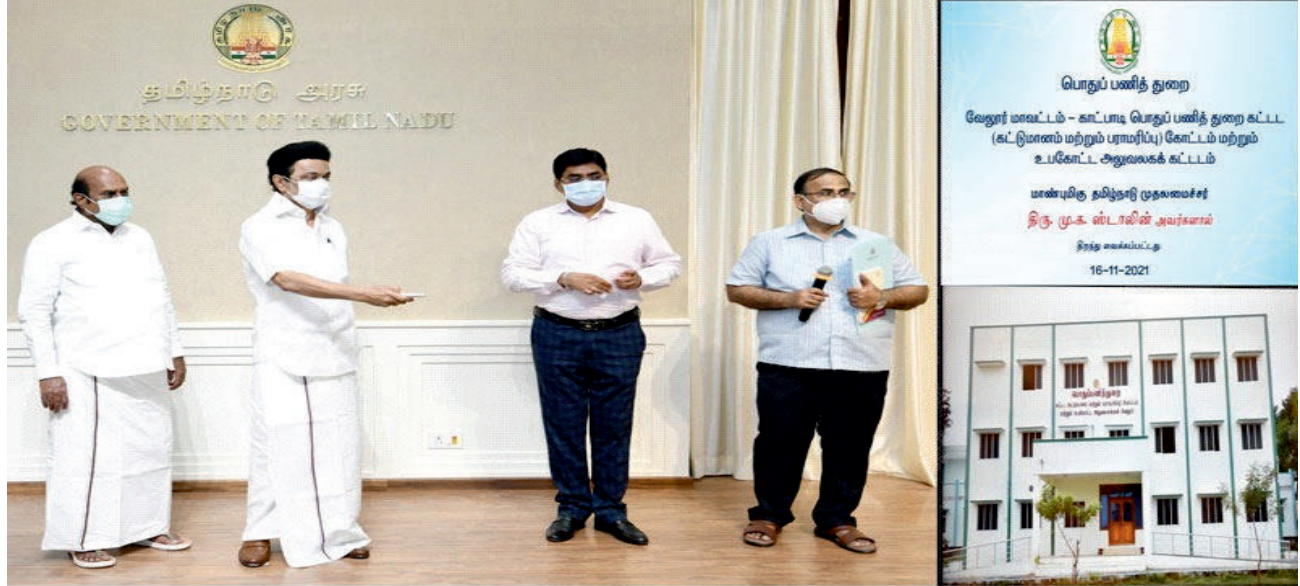
The Office of Public Works Department Buildings (Construction & Maintenance) Division and Sub Division at Katpadi, Vellore was inaugurated on 16.11.2021 by the Hon'ble Tamil Nadu Chief Minister Thiru.M.K.Stalin through Video Conferencing at Secretariat