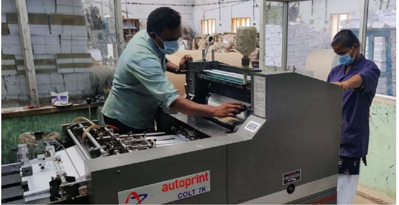
தனித்தாள் அச்ச இயந்திரம், அரசு கிளை அச்சகம், திருச்சி.