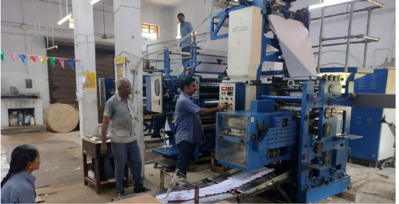
இரு வண்ண வெப் ஆப்செட் இயந்திரம், அரசு கிளை அச்சகம், புதுக்கோட்டை.