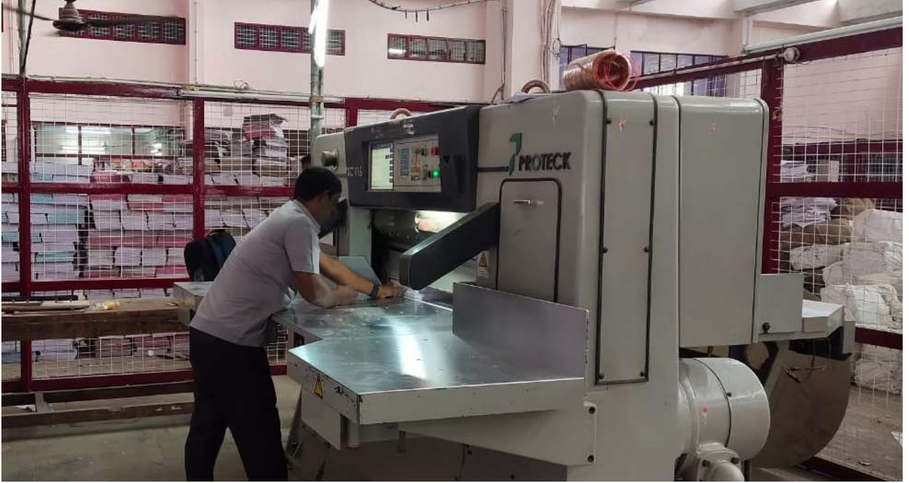
காகிதம் வெட்டும் இயந்திரம், அரசு கிளை அச்சகம், சேலம்.