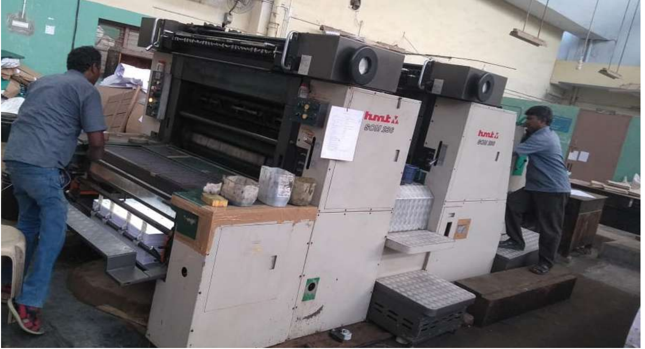
இரு வண்ண தனித்தாள் ஆப்செட் இயந்திரம், அரசு கிளை அச்சகம், மதுரை-7.