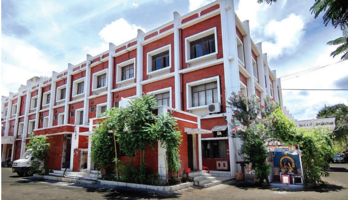
பிரதான கட்டடம், அரசு மைய அச்சகம், சென்னை-1