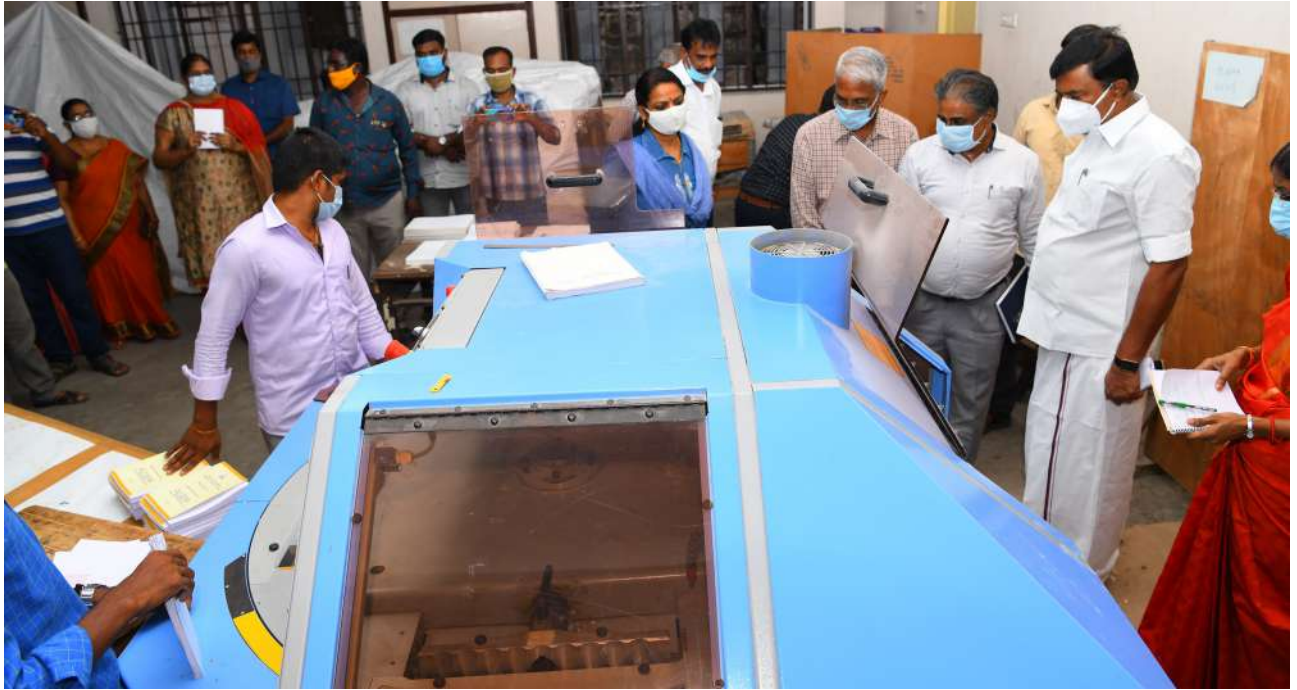
மாண்புமிகு செய்தித்துறை அமைச்சர் அவர்கள், அரசு மைய அச்சகத்தில் உள்ள புத்தகம் கட்டும் இயந்திரத்தைப் பார்வையிட்டார்.