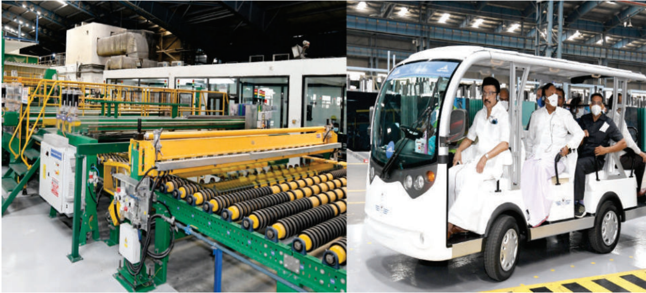
Hon'ble Chief Minister visiting Saint-Gobain's Float Glass Plant and Integrated Windows Line at Sriperambudur in Kancheepuram District