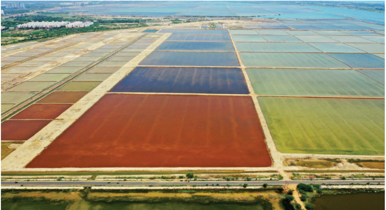
Ariel view of Tamil Nadu Salt Corporation campus at Thiruporur in Chenglepet District