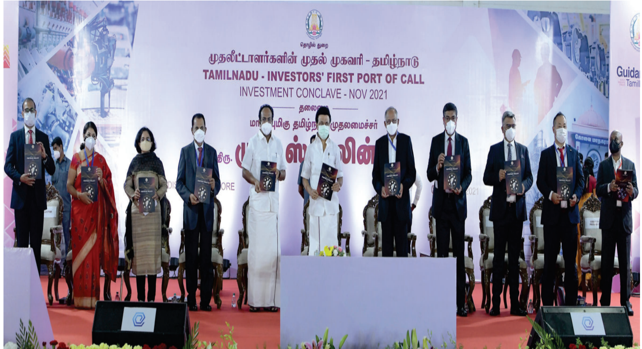
Hon'ble Chief Minister released "Tamil Nadu FinTech Policy 2021" during Investment Conclave on 23.11.2021