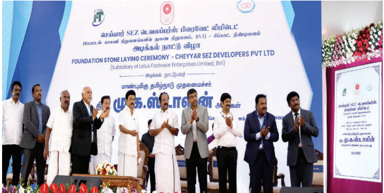
Hon'ble Chief Minister laying a Foundation Stone for Footwear Factory at Cheyyar SEZ Developers for a project cost of Rs.500 crore in Pelakuppam , Villupuram District on 05.04.2022