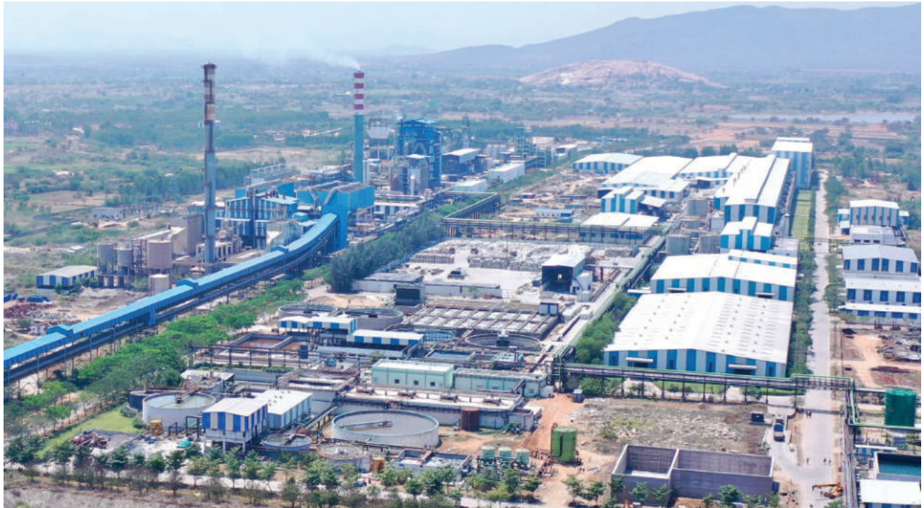
Aerial View of Paper Board Manufacturing Plant of TNPL Unit – II at Mondipatti Village in Manapparai Taluk, Tiruchirapalli District