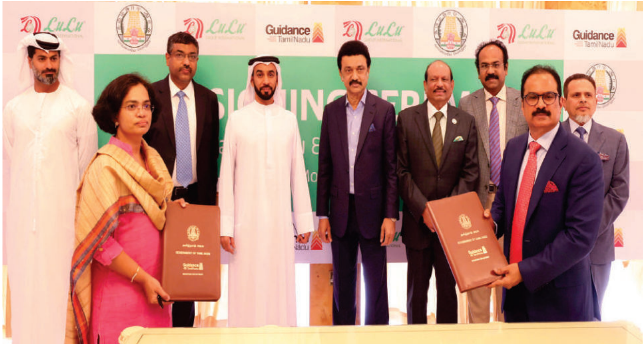
In the presence of Hon'ble Chief Minister, MoU with Lulu Group for investment of Rs.3500 crore signed on 28.03.2022