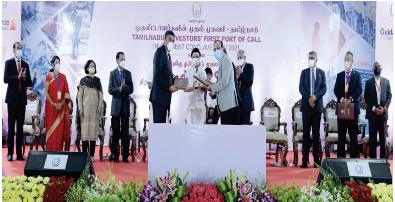
In the presence of Hon'ble Chief Minister, Companies signed MoUs during “Investment Conclave” on 23.11.2021