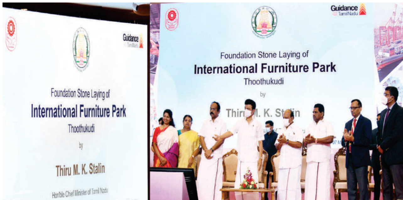
Hon'ble Chief Minister laying Foundation Stone for International Furniture Park at Thoothukudi District on 07.03.2022