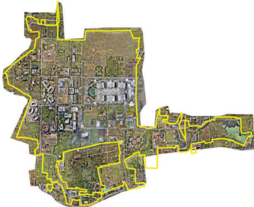
SIPCOT Siruseri Information Technology Park taken through GIS Mapping