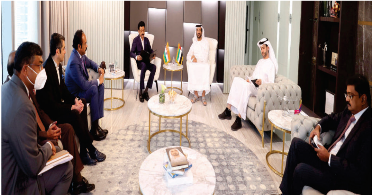
Hon'ble Chief Minister discussed about investments in Tamil Nadu with Ministers of United Arab Emirates at Dubai International Finance Centre on 25.03.2022