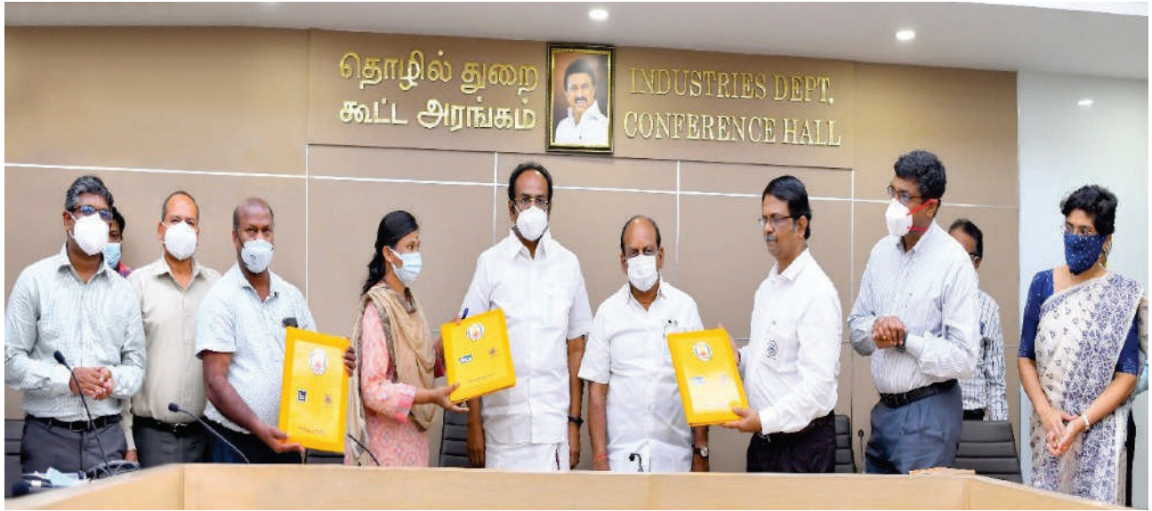
TIIC signed MOU with SIDCO and TAICO Bank on 08.12.2021 at the Secretariat in the presence of Hon'ble Minister for Industries and Hon'ble Minister for Micro, Small and Medium Enterprises.