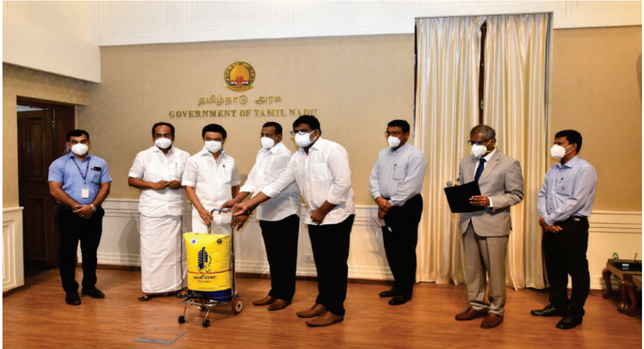
Hon'ble Chief Minister introduced the New Brand High Quality "Valimai Cement" on 16.11.2021