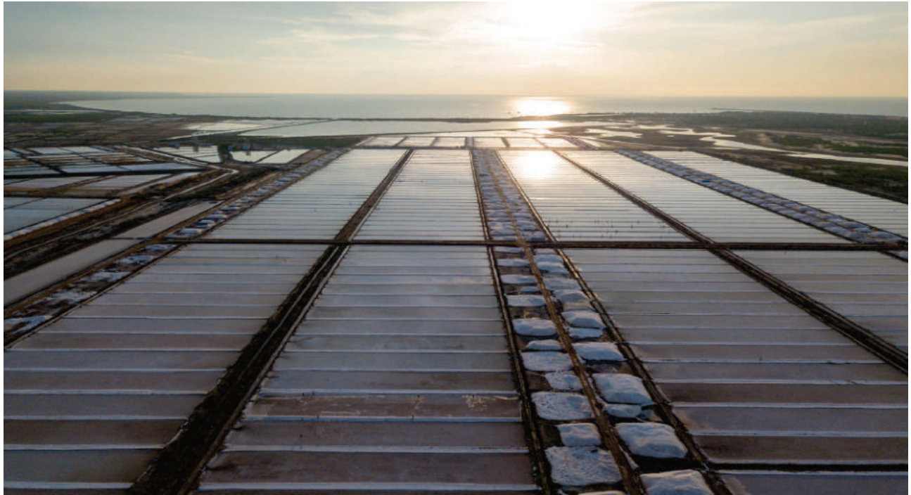
Ariel view of Salt Campus of Tamil Nadu Salt Corporation at Valinokkam in Ramanathapuram District