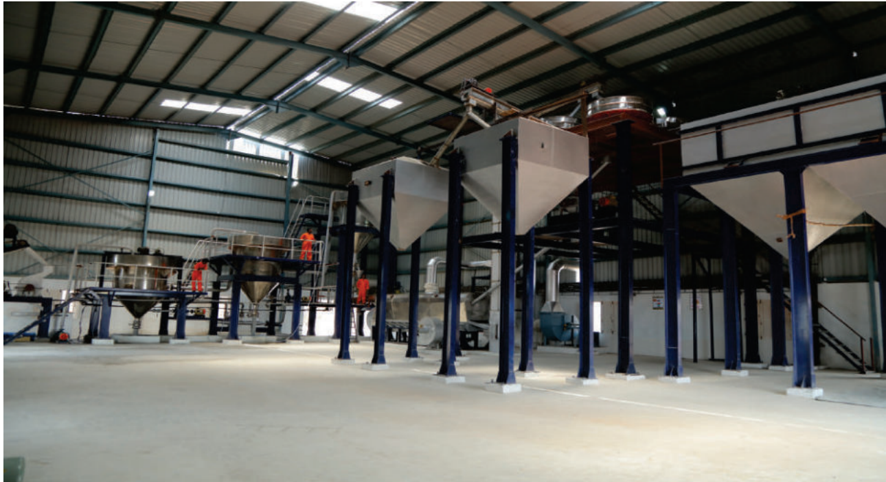
Tamil Nadu Salt Corporation's Salt Refinery at Valinokkam in Ramanathapuram District