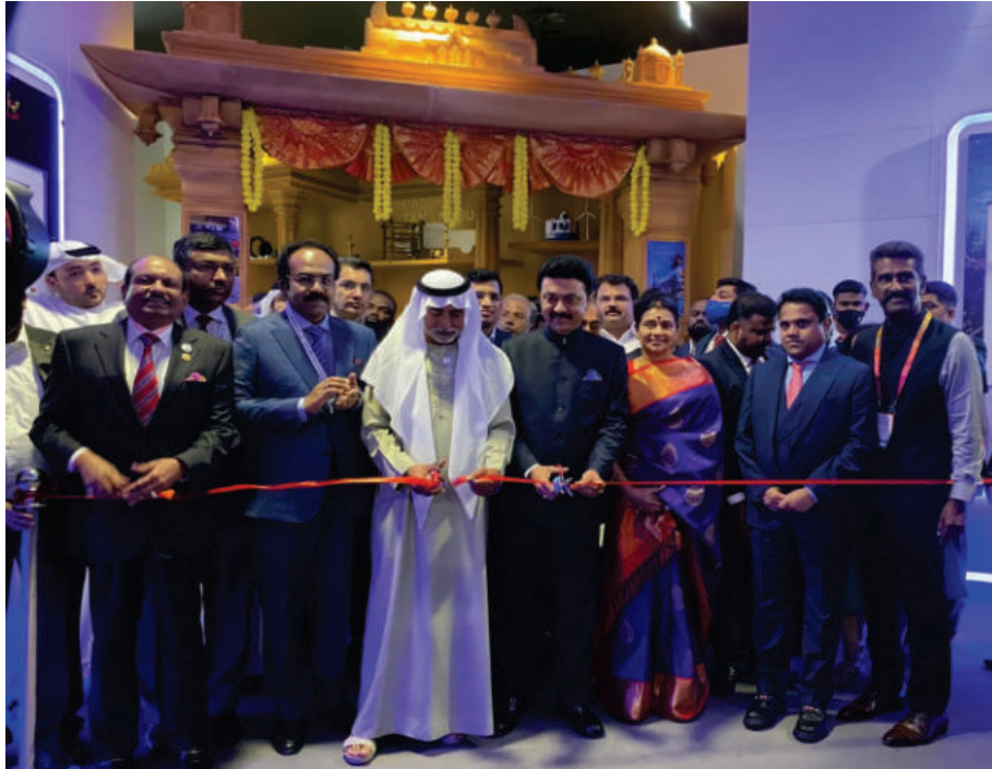
Hon'ble Chief Minister inaugurated Tamil Nadu Pavilion at Dubai World Expo on 25.03.2022