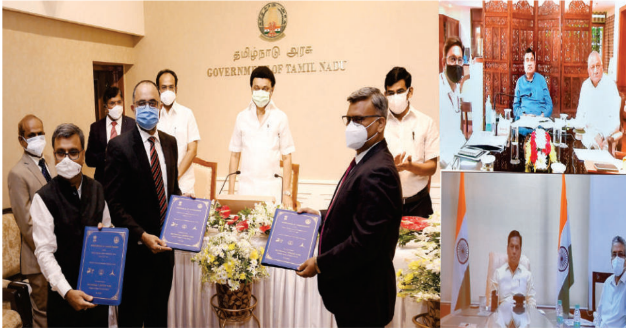
MoU was signed between National Highways Logistics Management Limited (NHLML), Chennai Port Trust and TIDCO in the presence of Hon'ble Chief Minister of Tamil Nadu on 12.10.2021