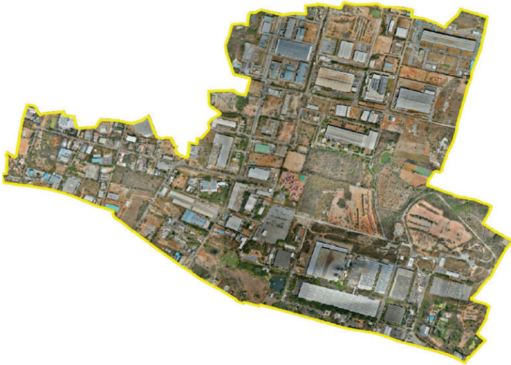
SIPCOT Hosur Industrial Park taken through GIS Mapping.