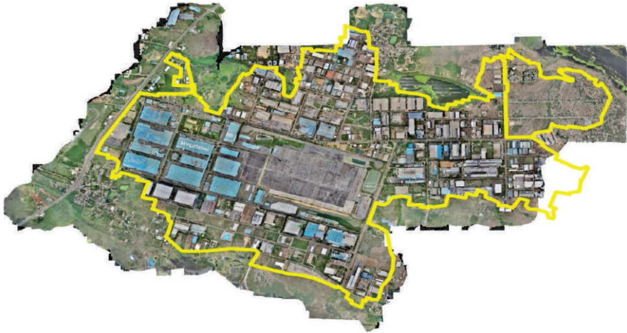
SIPCOT Irungattukottai Industrial Park taken through GIS Mapping