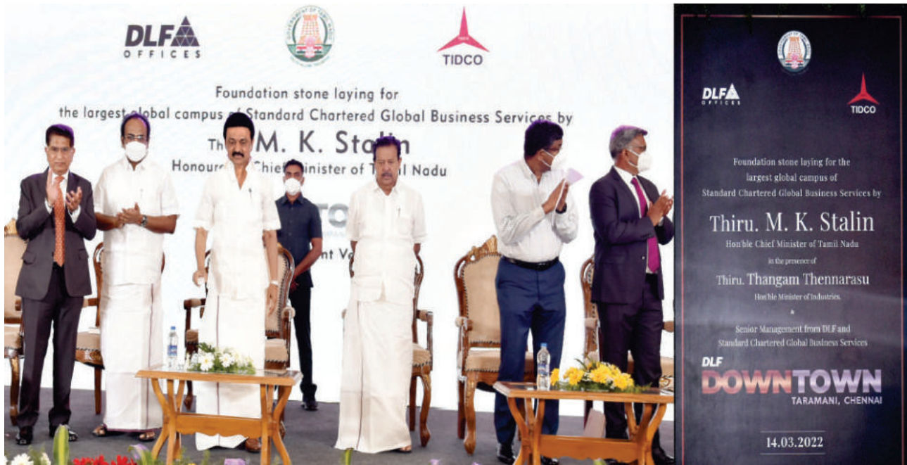
Hon'ble Chief Minister laid the foundation stone for the global campus of Standard Chartered Global Business Services at D.L.F. Downtown in Taramani, Chennai on 14.03.2022