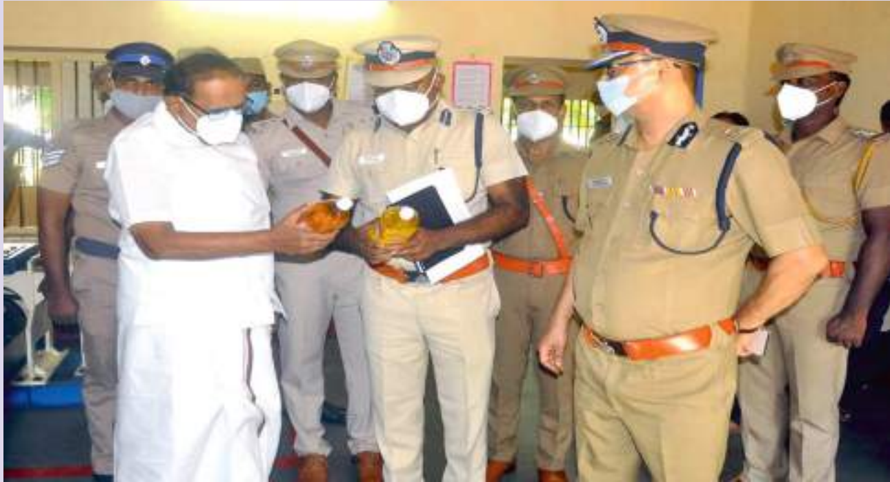
The Hon'ble Minister for Law visit the Cold Pressed Oil Unit at Central Prison-II, Puzhal on 10.05.2021.