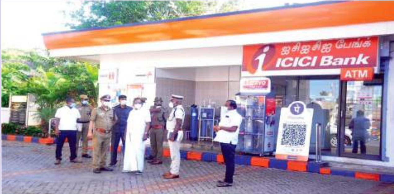
The Hon'ble Minister for Law visit the Petrol Bunk run by the Department of Prisons and Correctional Services at Central Prison Campus, Puzhal on 10.05.2021.