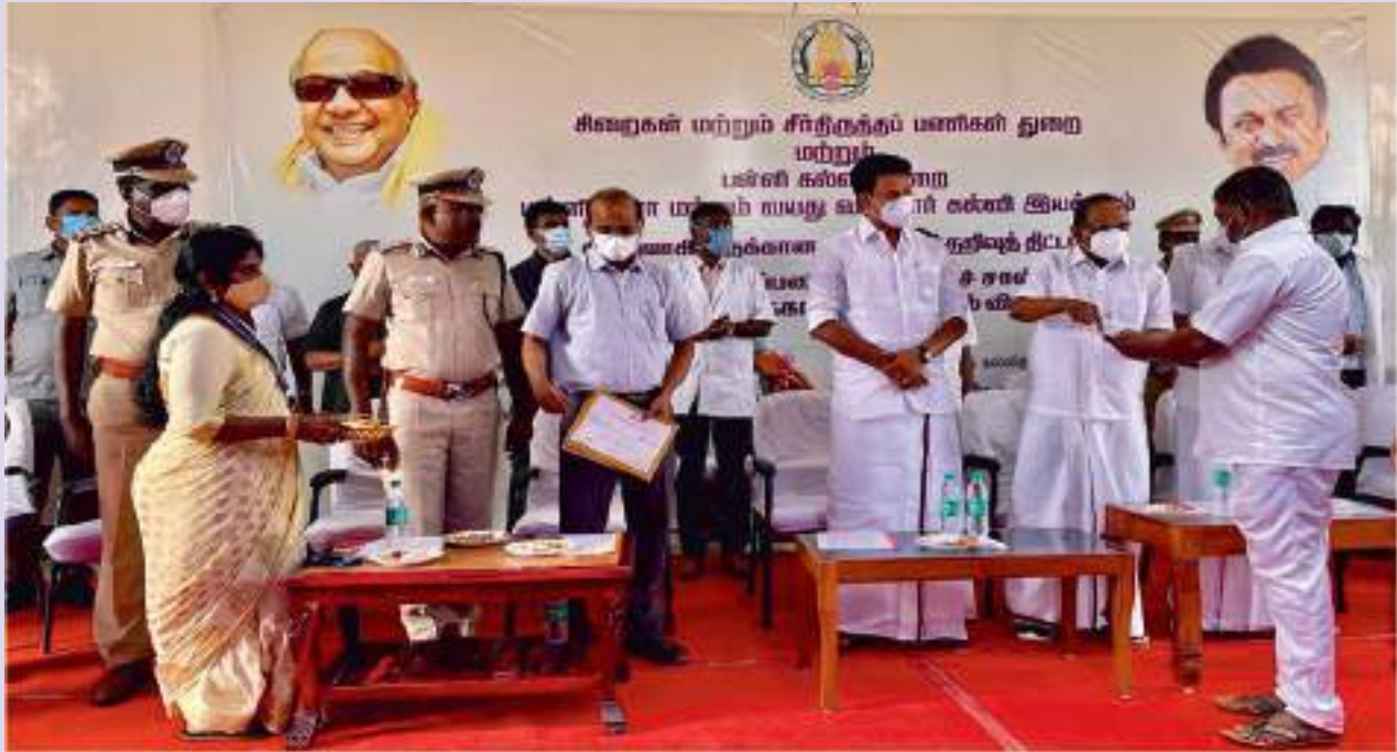
Adult Education and Special Literacy Mission Certificates & Library Books were issued to the inmates of Central Prison-I, Puzhal by the Hon'ble Ministers for Law and School Education Departments on 05.01.2022.