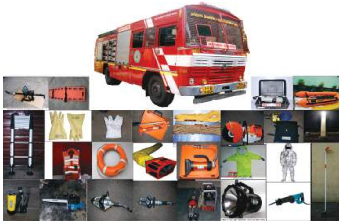
EMERGENCY RESCUE TENDER