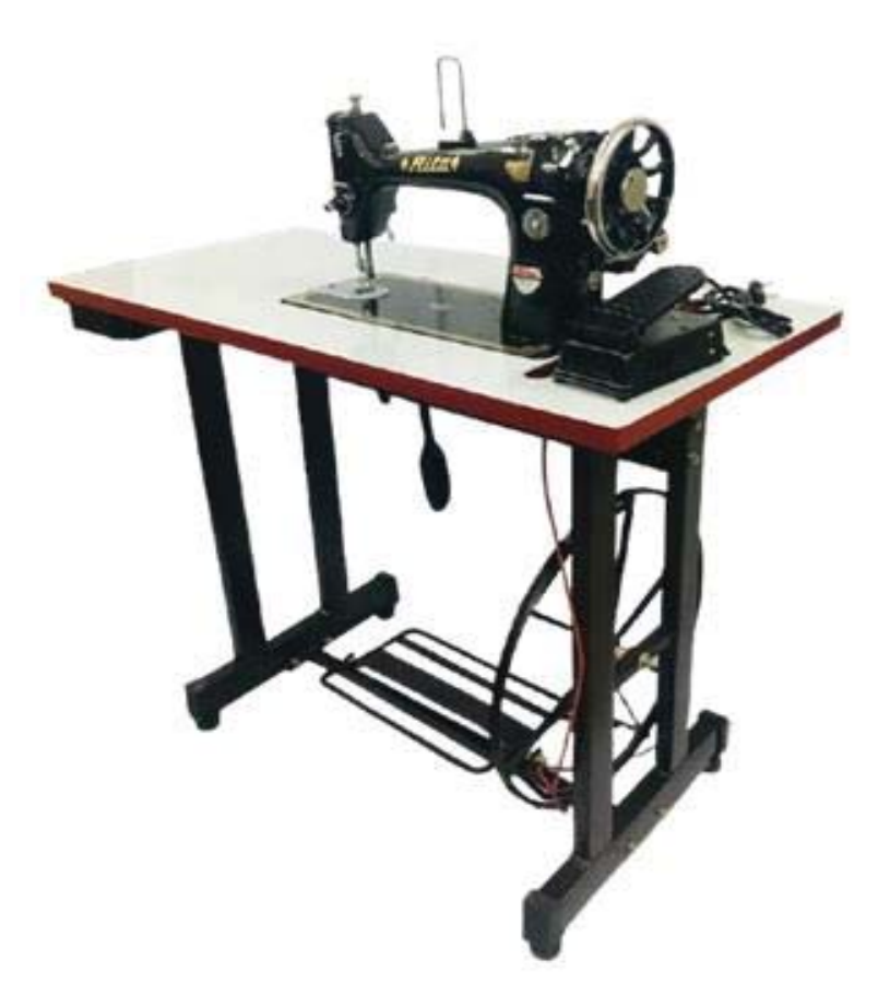
Motorized Sewing Machine