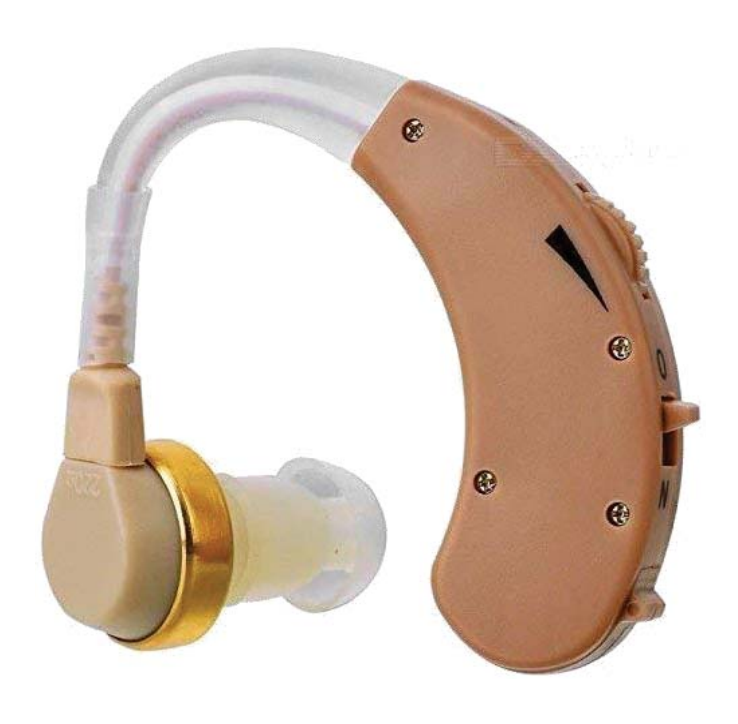
Behind the Ear Hearing Aid