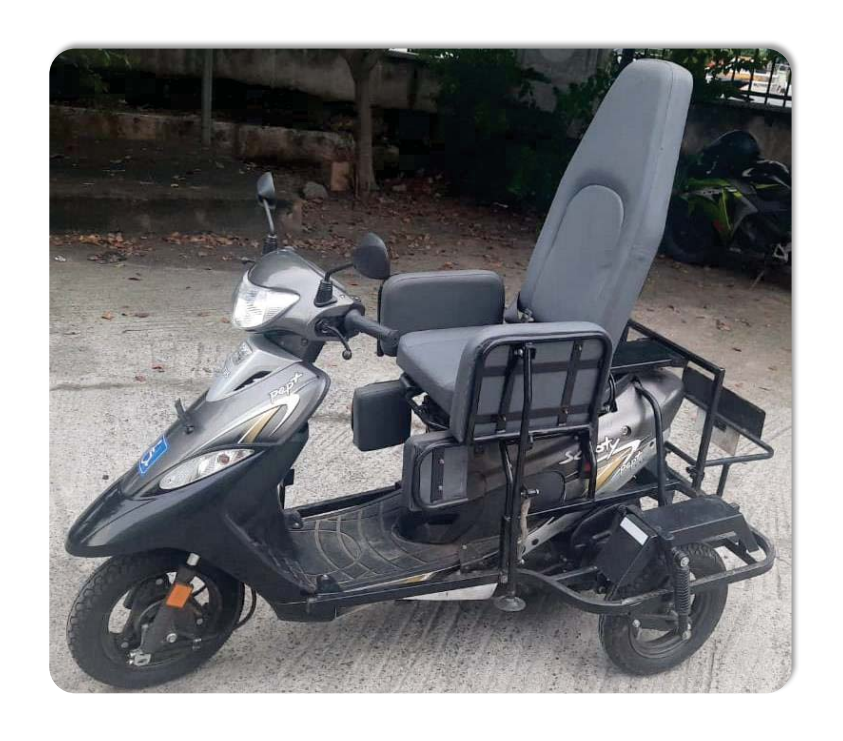
Specially Designed Retro-Fitted Petrol Scooter for Spinal Cord affected persons