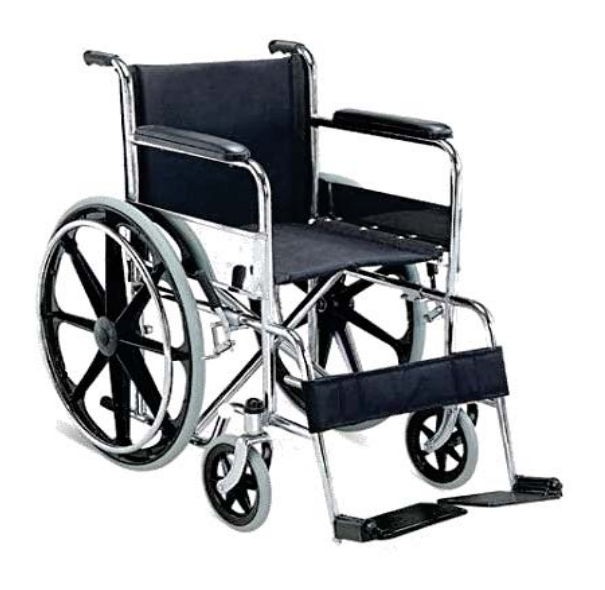
Foldable Wheel Chair