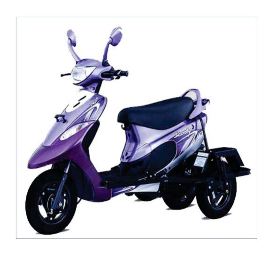
Retro-Fitted Petrol Scooter