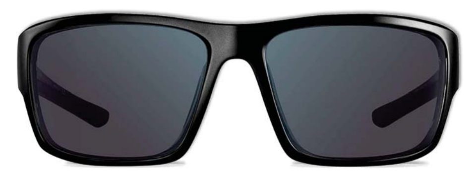
Goggles for Visually Impaired Persons