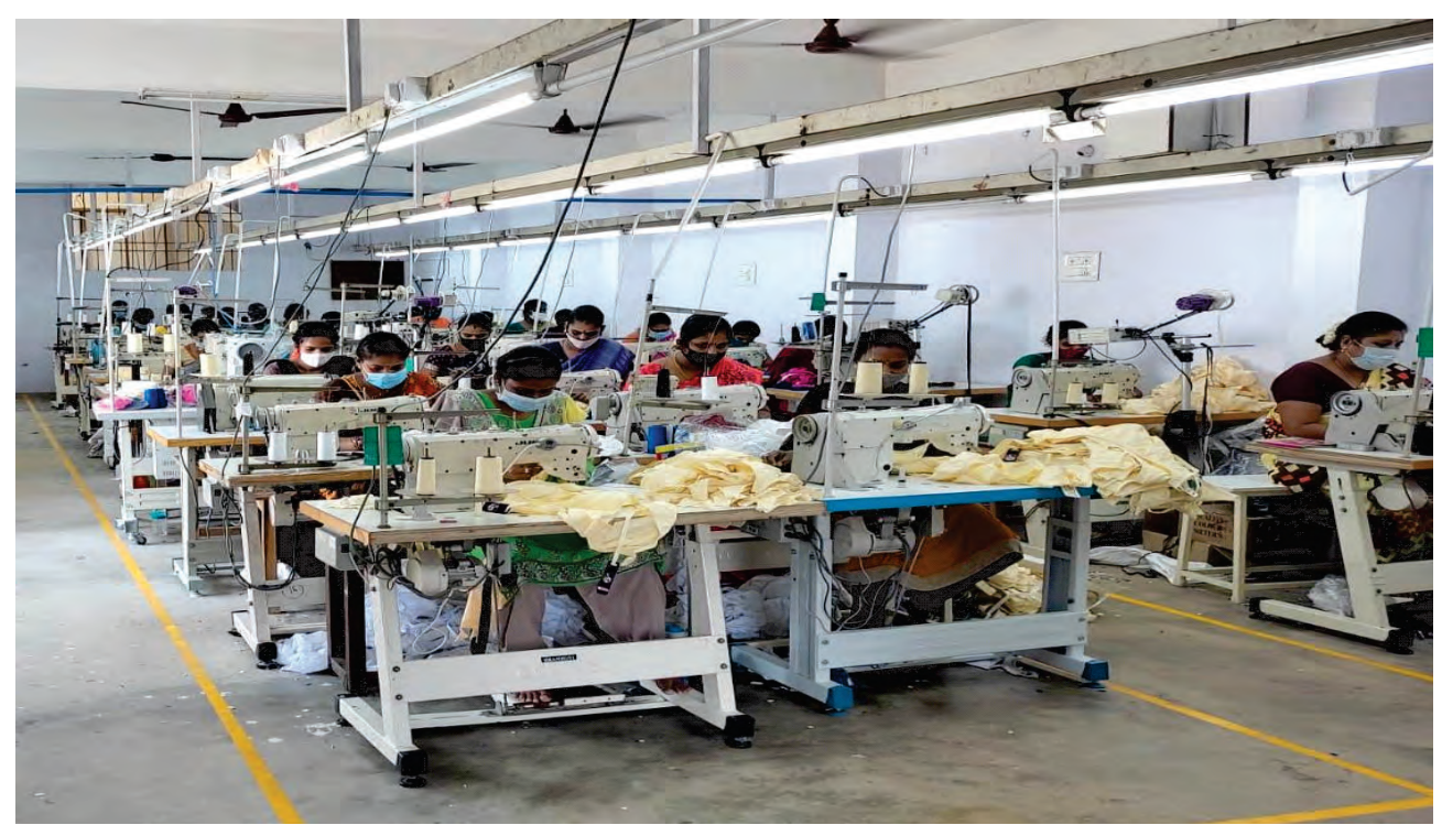
A Hosiery Garments Manufacturing unit assisted under Payroll Subsidy Scheme, Vellore District