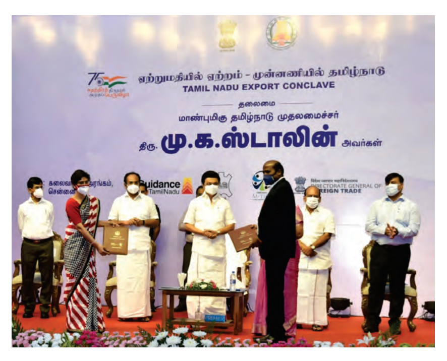
Tamil Nadu Export Conclave

MoUs were signed in the presence of Hon'ble Chief Minister between Government of Tamil Nadu and 10 export oriented MSME entrepreneurs for investment of Rs.240 crore during Tamil Nadu Export Conclave held at Chennai on 22.09.2021