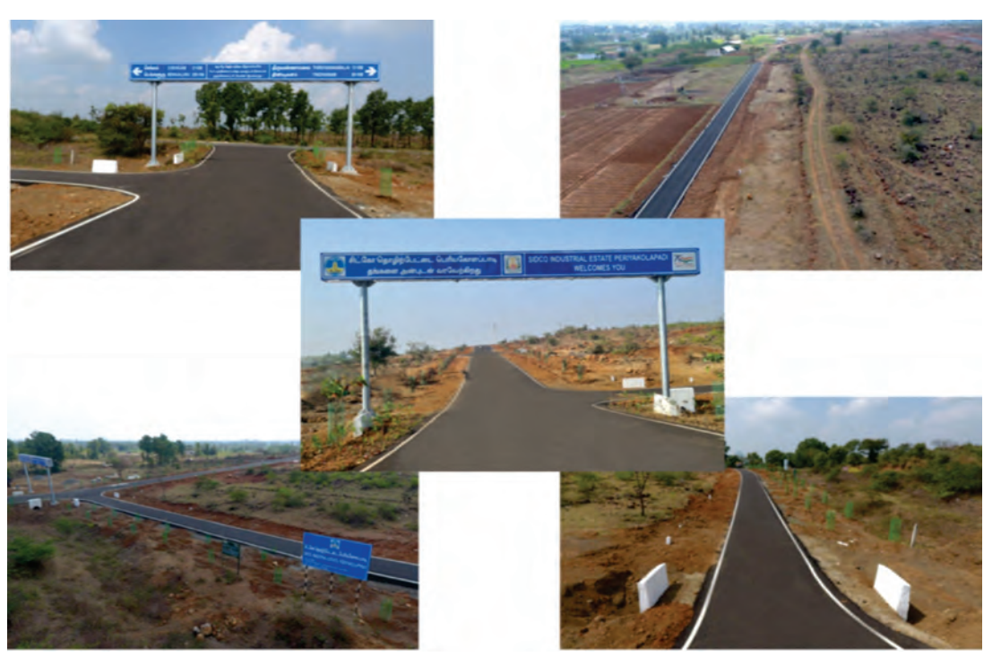
Formation of New Industrial Estate at Periakolapadi, Thiruvannamalai District