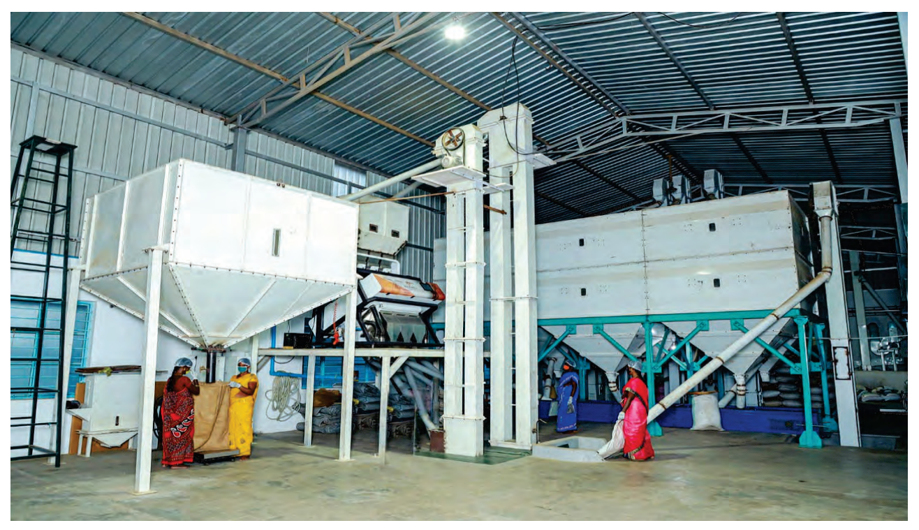
A Coffee Beans Processing unit assisted under NEED Scheme, Dindigul District