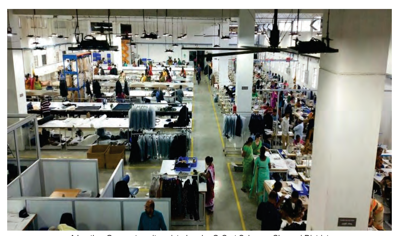
A Leather Garments unit assisted under Q-Cert Scheme, Chennai District