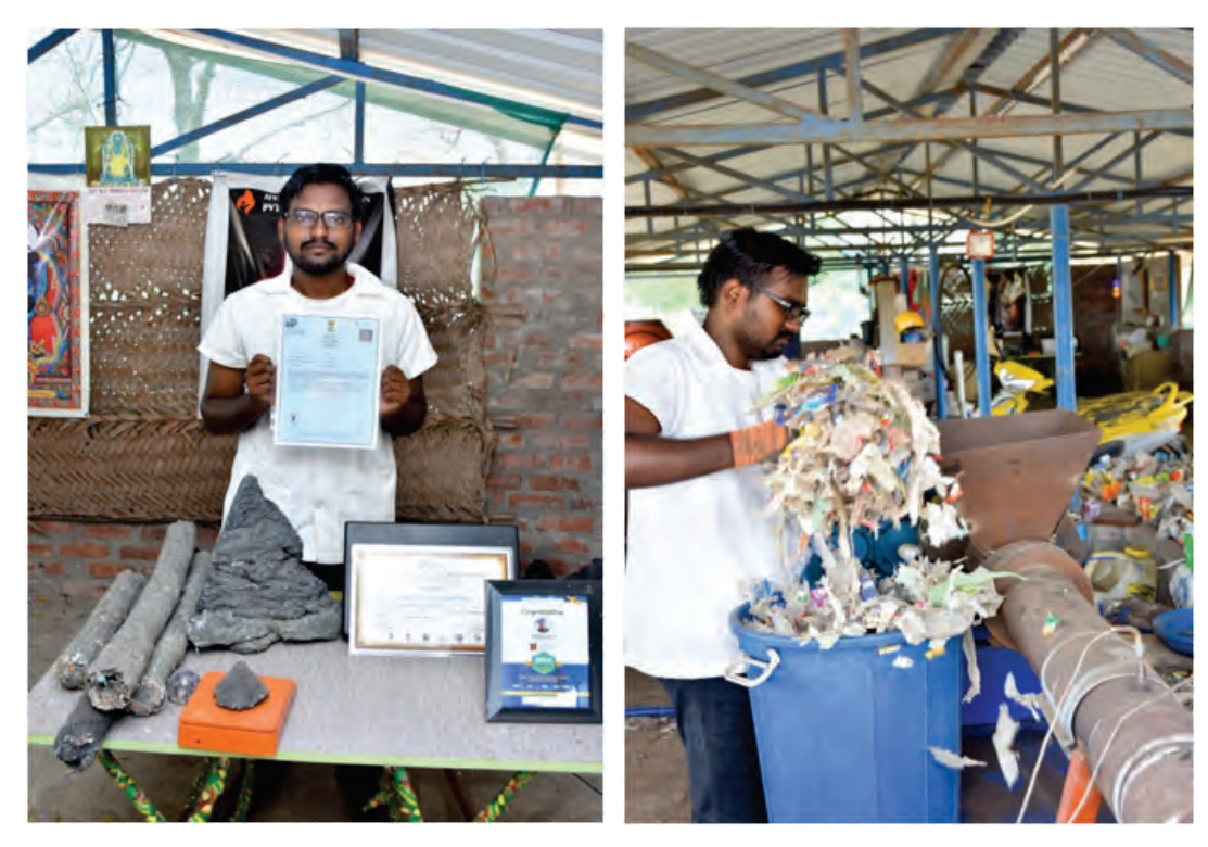
A Plastic Waste Recycling unit assisted under incentive scheme for IPR (Patent), Ramanathapuram District