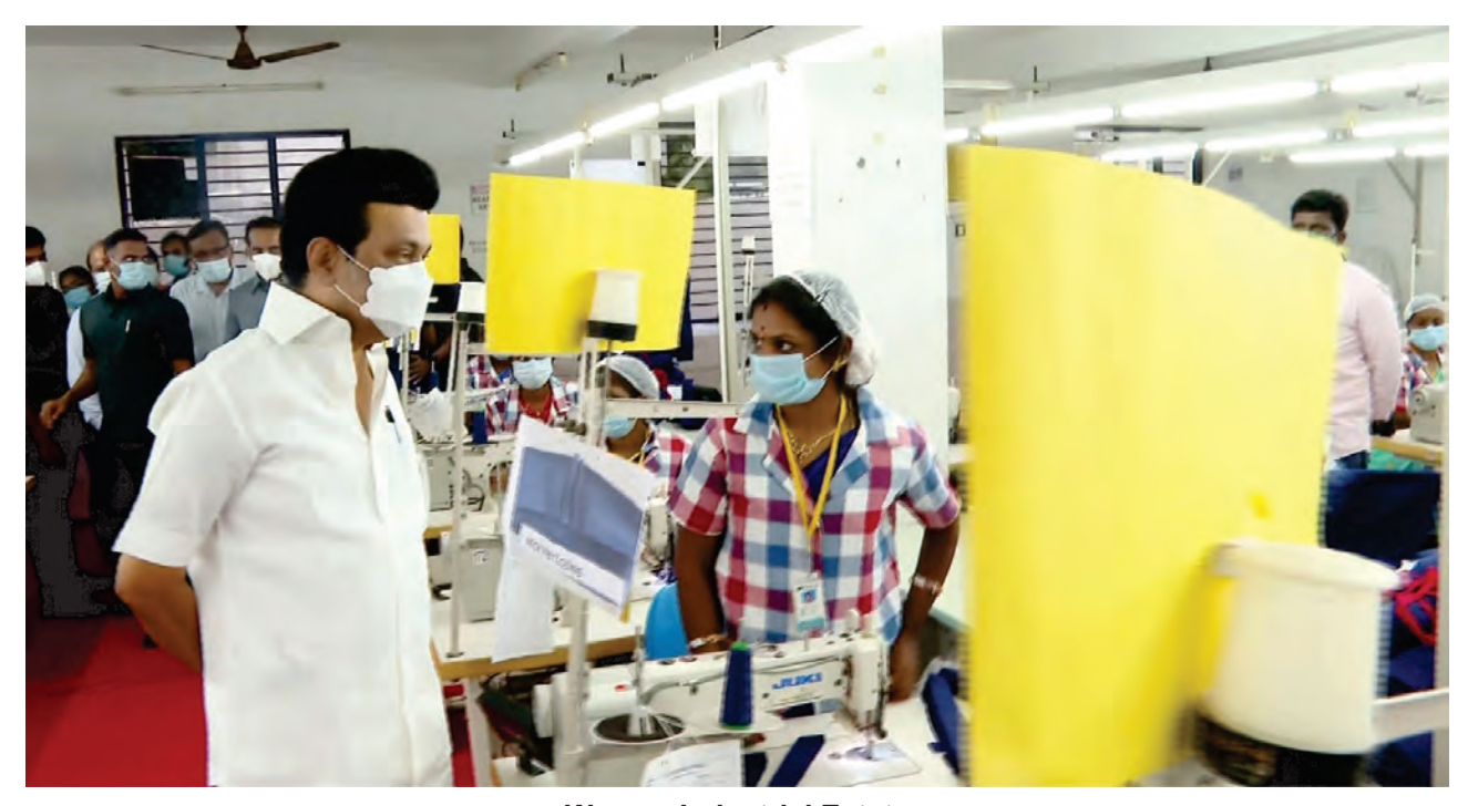
Women Industrial Estate

Hon'ble Chief Minister visited an export oriented Garment unit functioning at Women Industrial Estate, Karuppur, Salem on 29.09.2021