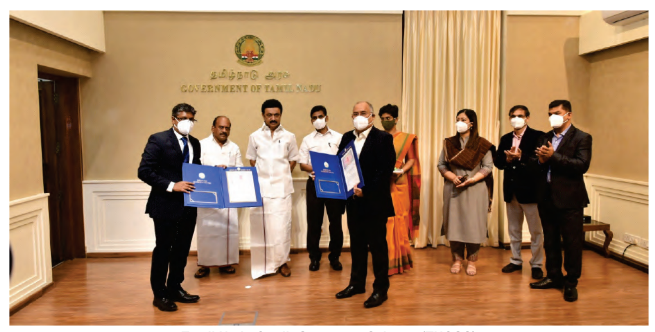
Tamil Nadu Credit Guarantee Scheme (TNCGS)

MoU was signed in the presence of Hon'ble Chief Minister between Government of Tamil Nadu and CGTMSE for developing an end-to-end electronic platform for TNCGS in a ceremony at the Secretariat on 16.03.2022