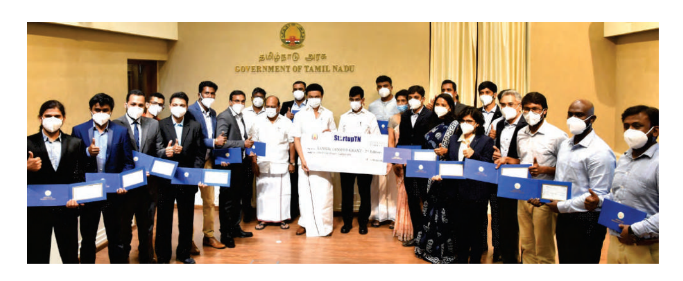
TANSEED Scheme for Start-ups

The Hon'ble Chief Minister handed over cheques to the tune of Rs.95.00 lakh to 19 Start-ups, each at the rate of Rs.5 lakh under TANSEED Scheme of TANSIM in a ceremony at the Secretariat on 21.12.2021