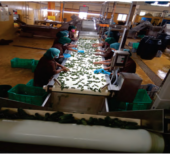
A Vegetable Processing unit assisted under Reimbursement of Stamp Duty and Registration Charges, Dharmapuri District