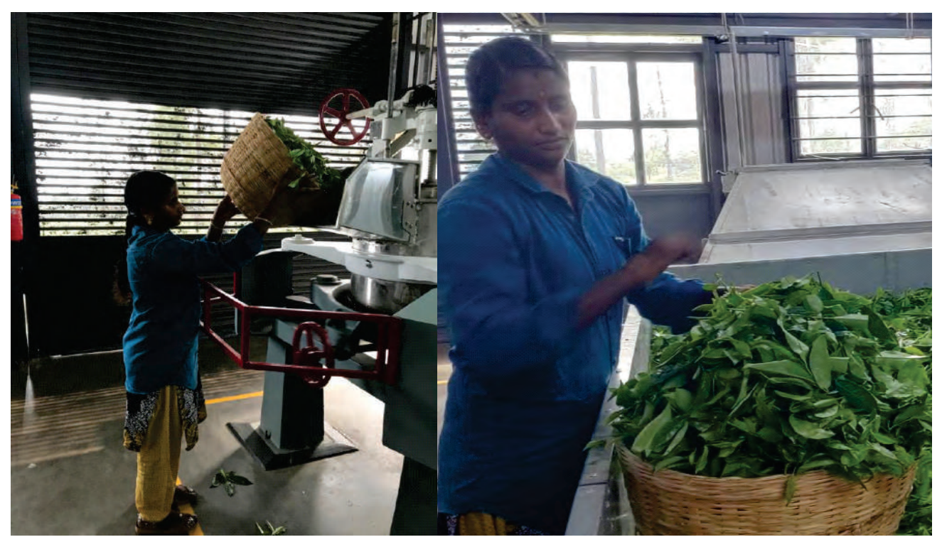
A Tea Manufacturing unit assisted under Capital Subsidy Scheme, The Nilgiris District