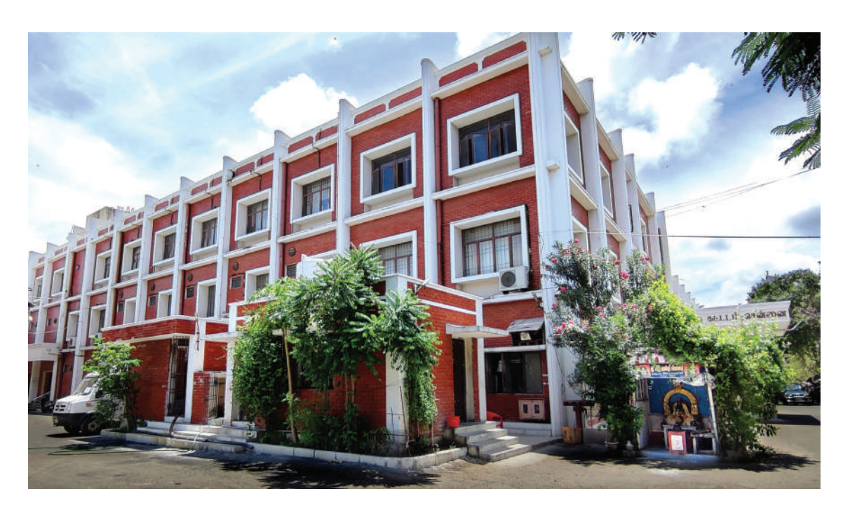
பிரதான கட்டடம், அரசு மைய அச்சகம், சென்னை -1