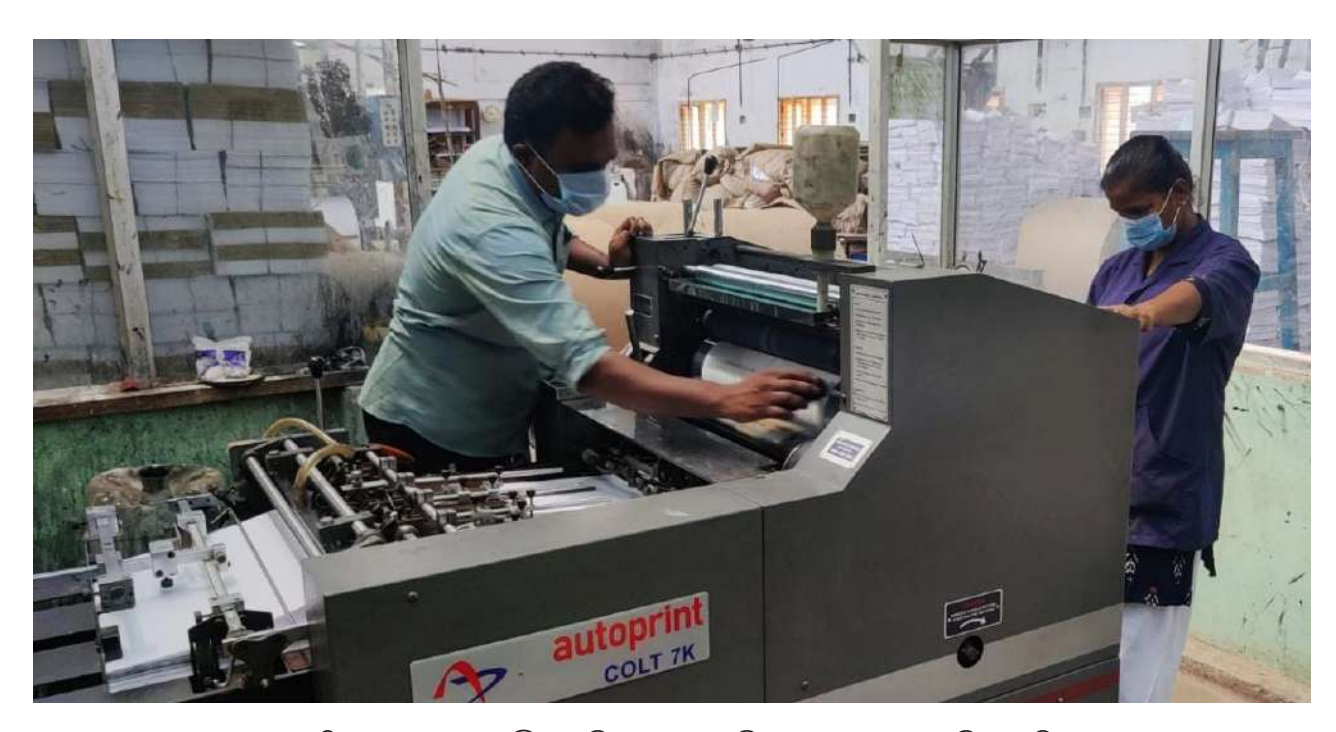
தனித்தாள் அச்சு இயந்திரம், அரசு கிளை அச்சகம், திருச்சி.