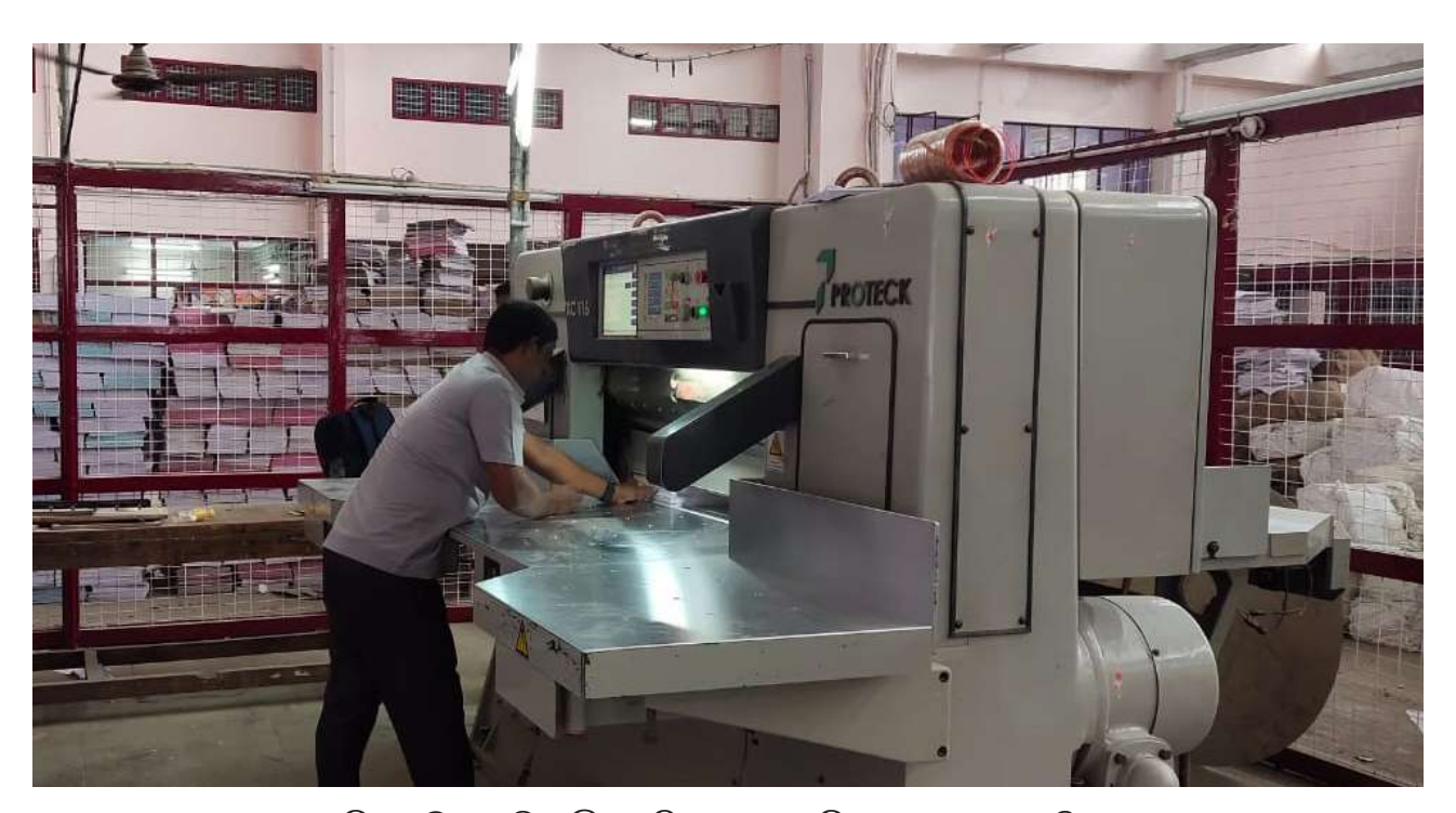
காகிதம் வெட்டும் இயந்திரம், அரசு கினை அச்சகம், சேலம்.