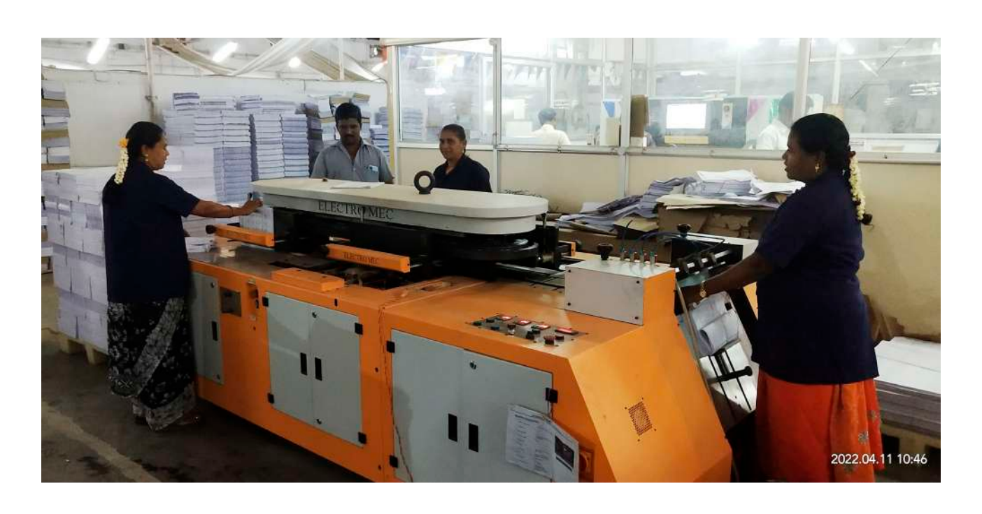
புத்தகம் கட்டும் இயந்திரம், அரசு கிளை அச்சகம், விருத்தாசலம்.