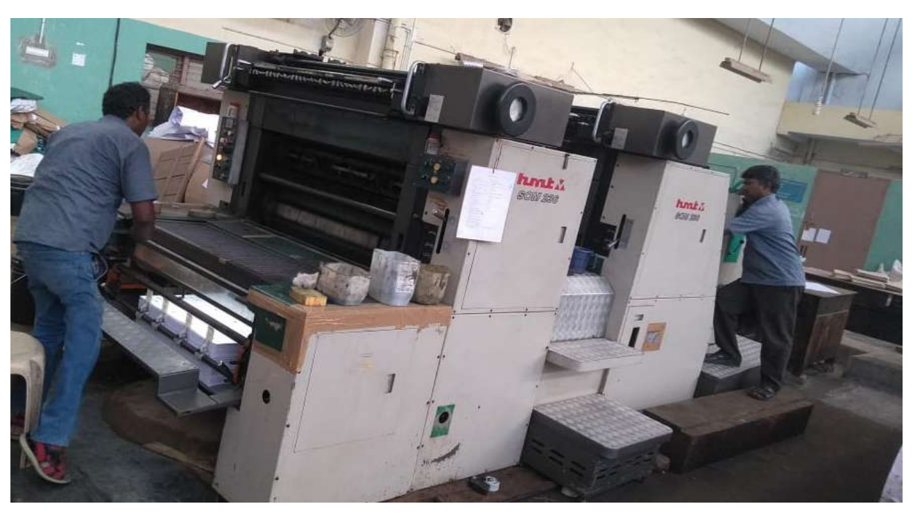
இரு வண்ண தனித்தாள் ஆப்செட் இயந்திரம், அரசு கிளை அச்சகம், மதுரை-7.