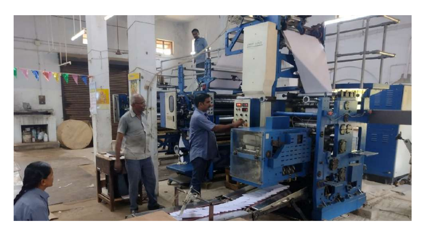
இரு வண்ண வெப் ஆப்செட் இயந்திரம், அரசு கிளை அச்சகம், புதுக்கோட்டை.