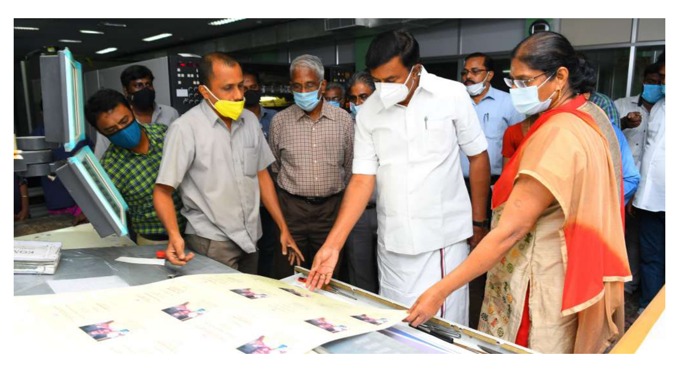
மாண்புமிகு செய்தித்துறை அமைச்சர் அவர்கள், அரசு மைய அச்சகத்தில் உள்ள நான்கு வண்ண கணினி வழி தனித்தாள் அச்சு இயந்திரத்தைப் பார்வையிட்டார்.