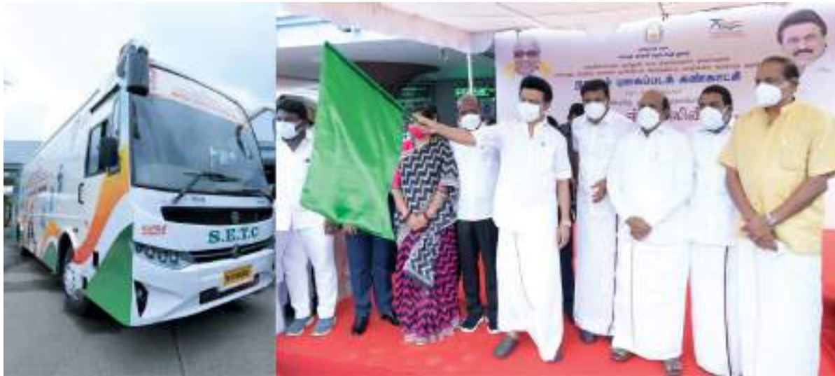
Hon'ble Chief Minister of Tamil Nadu Thiru.M.K.Stalin flagged off the mobile photo exhibition bus to mark the 150 th birth anniversary of V.O.Chidambaranar (Chennai, 1.11.2021).