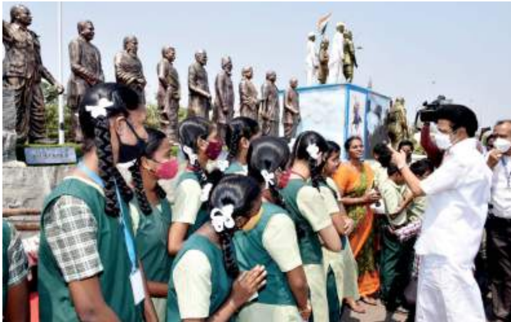
Hon'ble Chief Minister of Tamil Nadu Thiru.M.K.Stalin interacted with students who had come to witness the Republic Day floats (Chennai, 21.2.2022).