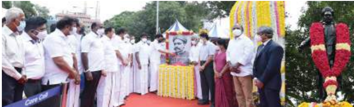
Hon'ble Chief Minister of Tamil Nadu Thiru. M.K.Stalin paid floral tributes to the portrait of V.O.Chidambaranar (Chennai, 5.9.2021).