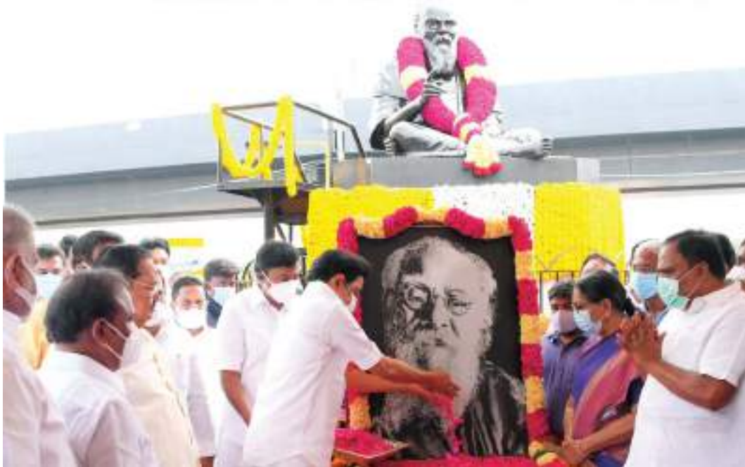
Hon'ble Chief Minister of Tamil Nadu Thiru.M.K.Stalin paid floral tributes to the portrait of Thanthai Periyar (Chennai, 17.9.2021).