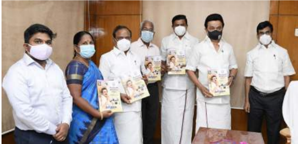
Hon'ble Chief Minister of Tamil Nadu Thiru.M.K.Stalin released the special publication of Tamilarasu (Chennai, 19.8.2021).