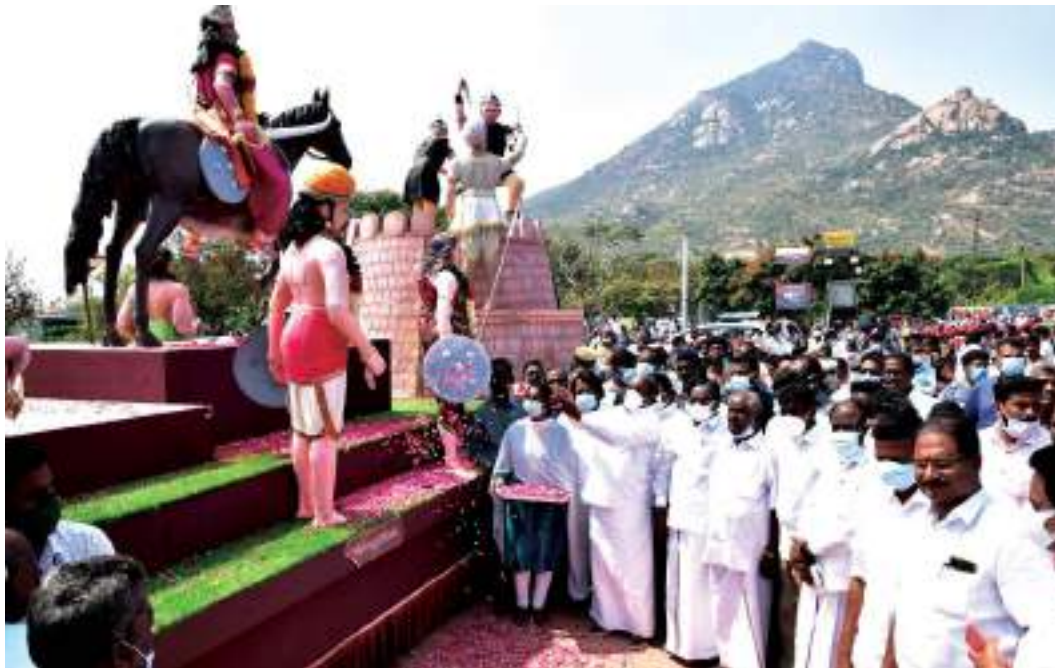
Republic Day float given a warm welcome by showering flowers (Tiruvannamalai, 17.2.2022).