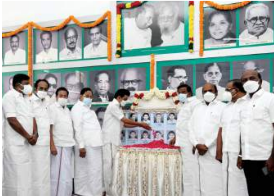
Hon'ble Chief Minister of Tamil Nadu Thiru.M.K.Stalin paid floral tributes to the portraits of Mozhipor Thiyagigal on Mozhipor Thiyagigal Day (Chennai, 25.1.2022).