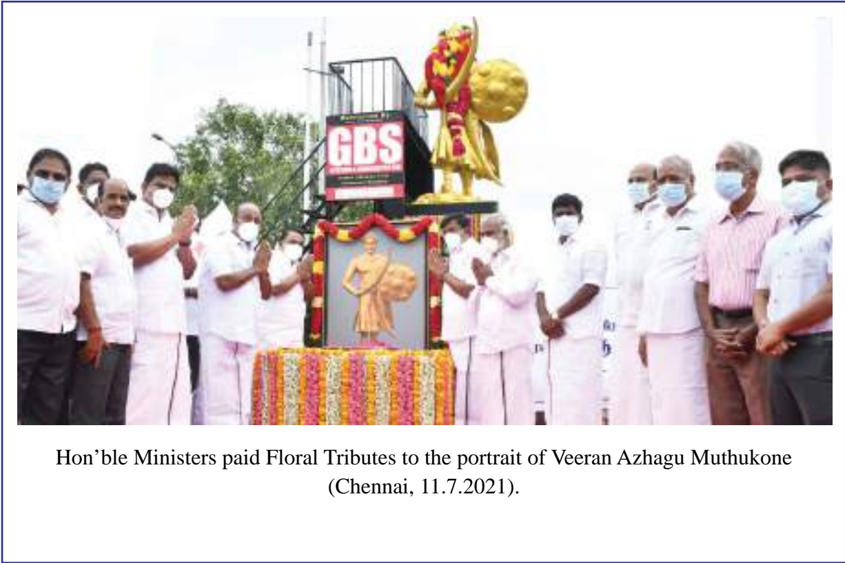
Hon'ble Ministers paid Floral Tributes to the portrait of Veeran Azhagu Muthukone (Chennai, 11.7.2021).