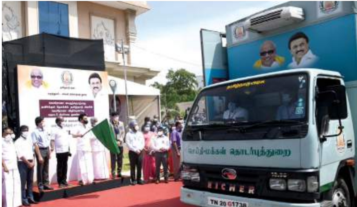
Hon'ble Chief Minister of Tamil Nadu Thiru. M.K.Stalin flagged off the Corona Awareness campaign vehicle (Chennai, 31.7.2021).