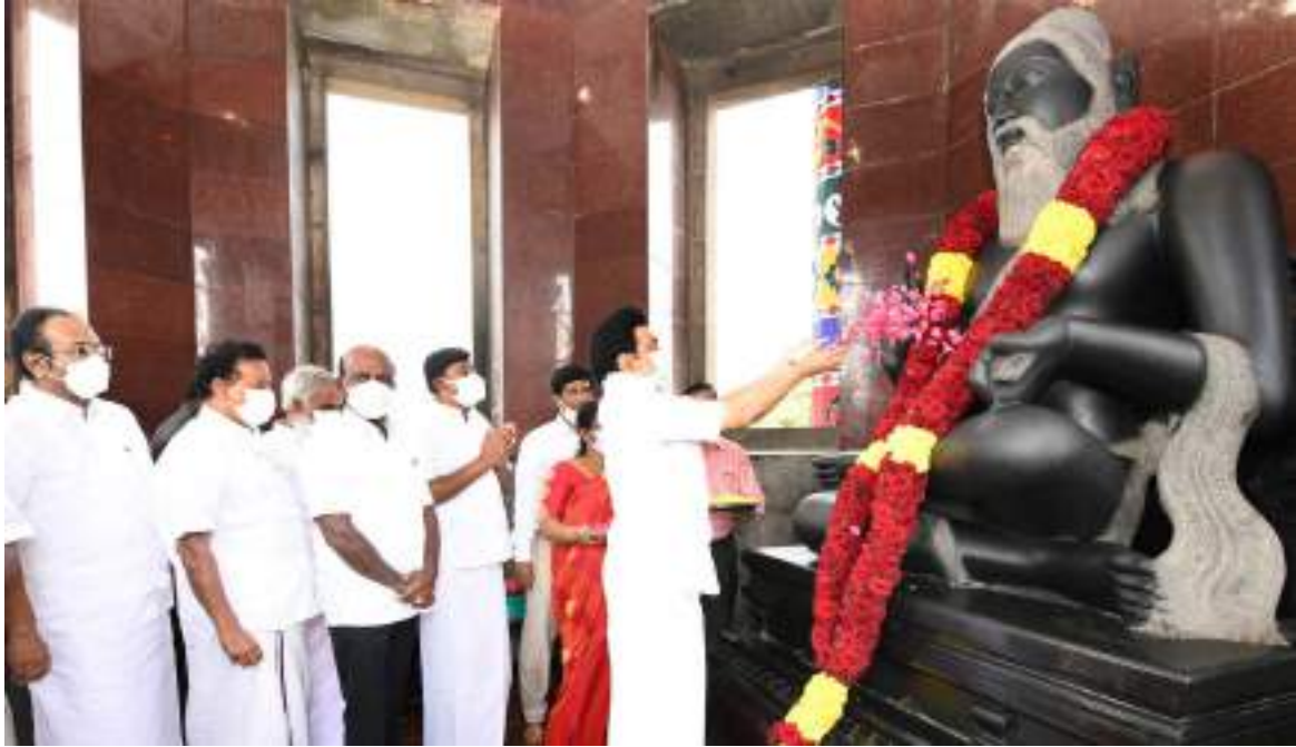
Hon'ble Chief Minister of Tamil Nadu Thiru.M.K.Stalin paid floral tributes to the statue of Iyyan Thiruvalluvar on Thiruvalluvar Day (Chennai, 15.1.2022).