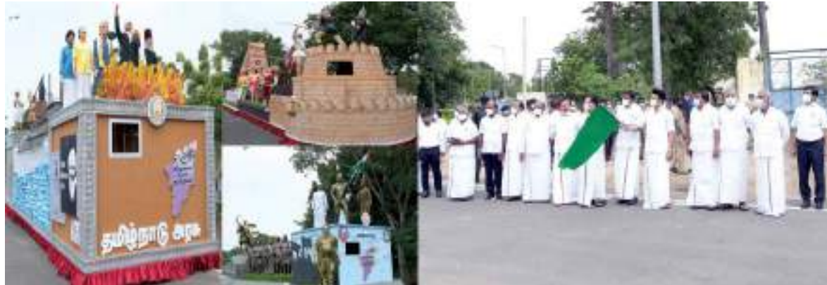
Hon'ble Chief Minister of Tamil Nadu Thiru.M.K.Stalin flagged off the Republic Day floats, for showcasing them in the districts (Chennai, 26.1.2022).