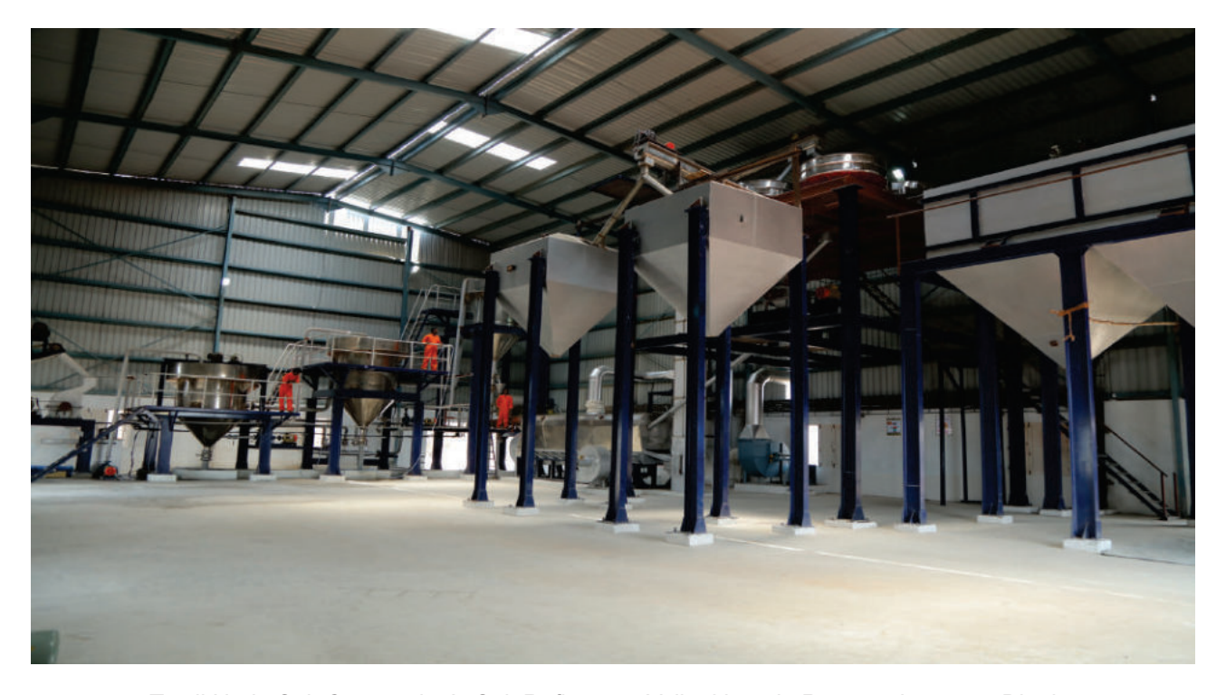
Tamil Nadu Salt Corporation's Salt Refinery at Valinokkam in Ramanathapuram District