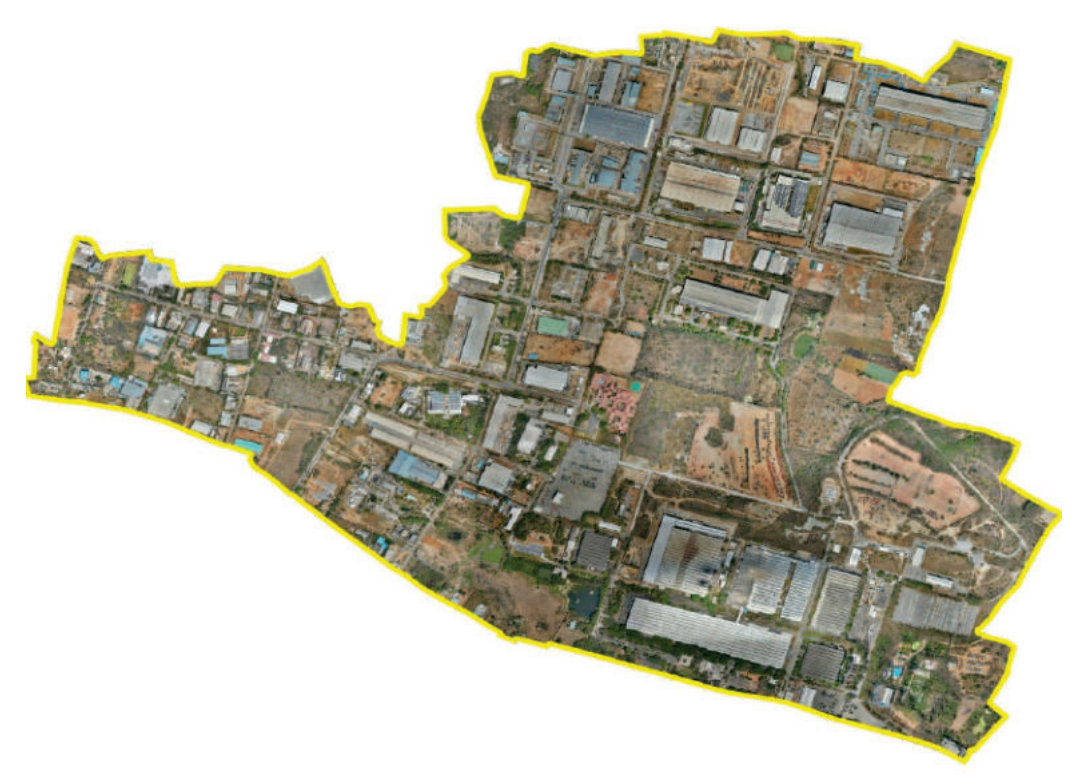
SIPCOT Hosur Industrial Park taken through GIS Mapping.