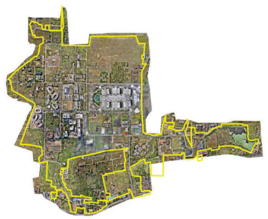
SIPCOT Siruseri Information Technology Park taken through GIS Mapping