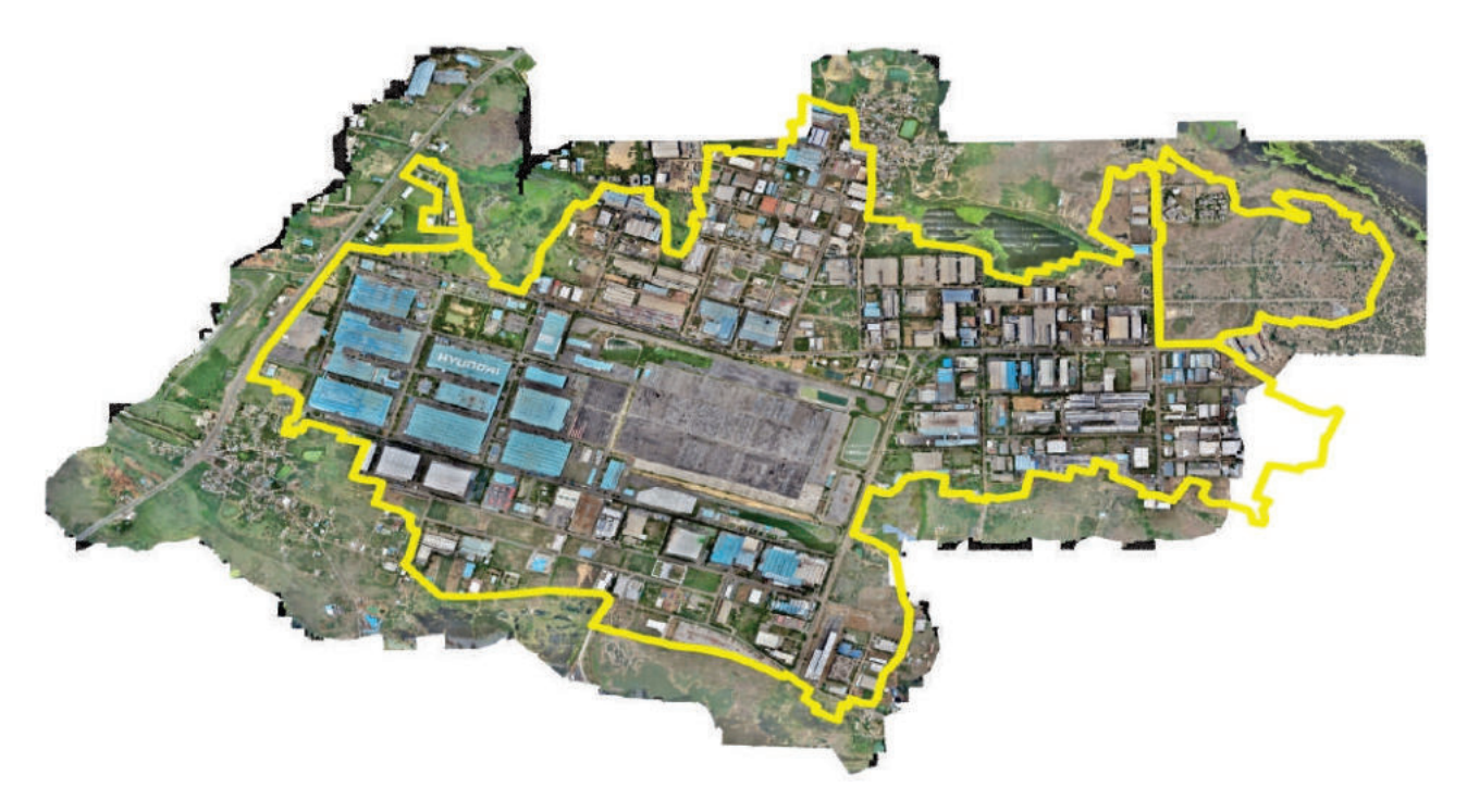
SIPCOT Irungattukottai Industrial Park taken through GIS Mapping