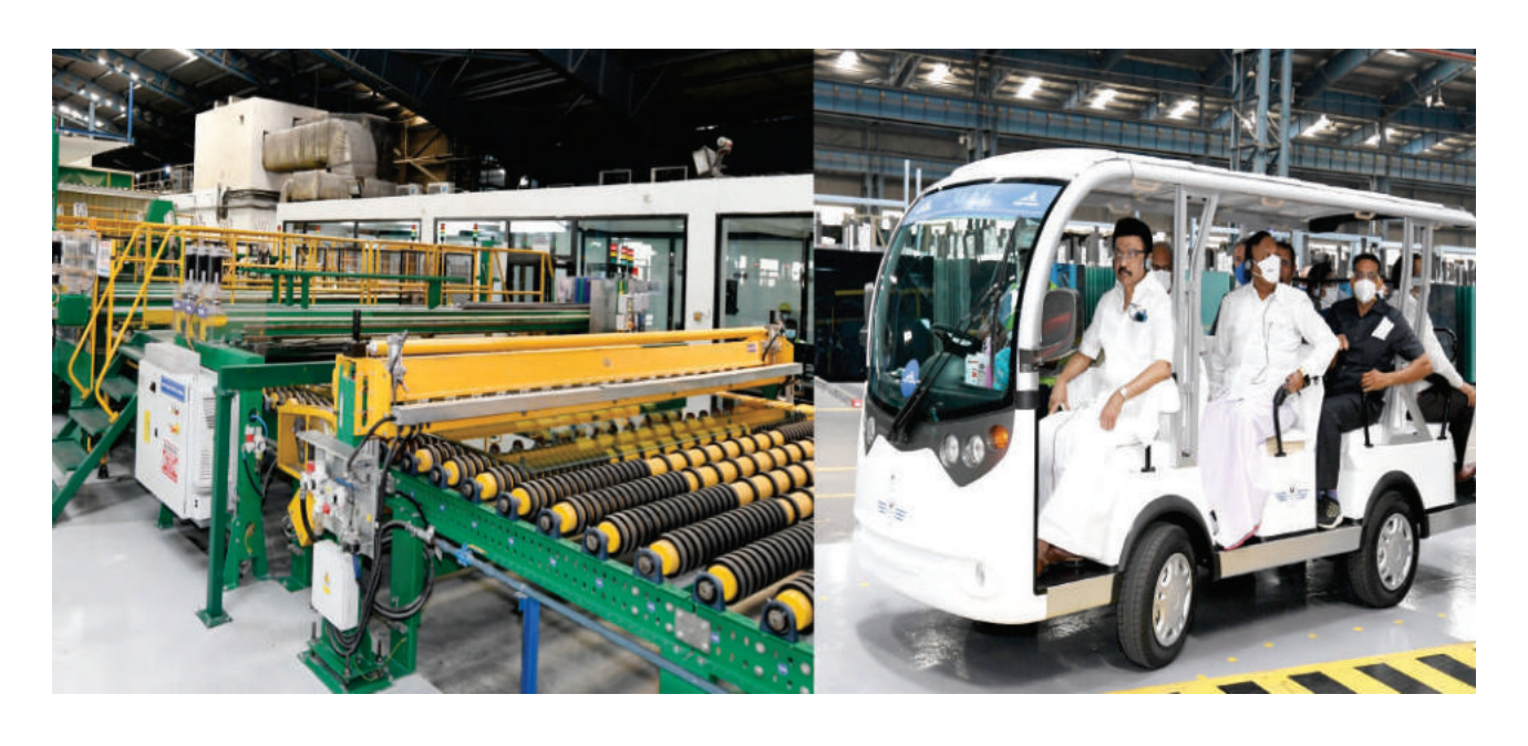
Hon'ble Chief Minister visiting Saint-Gobain's Float Glass Plant and Integrated Windows Line at Sriperambudur in Kancheepuram District