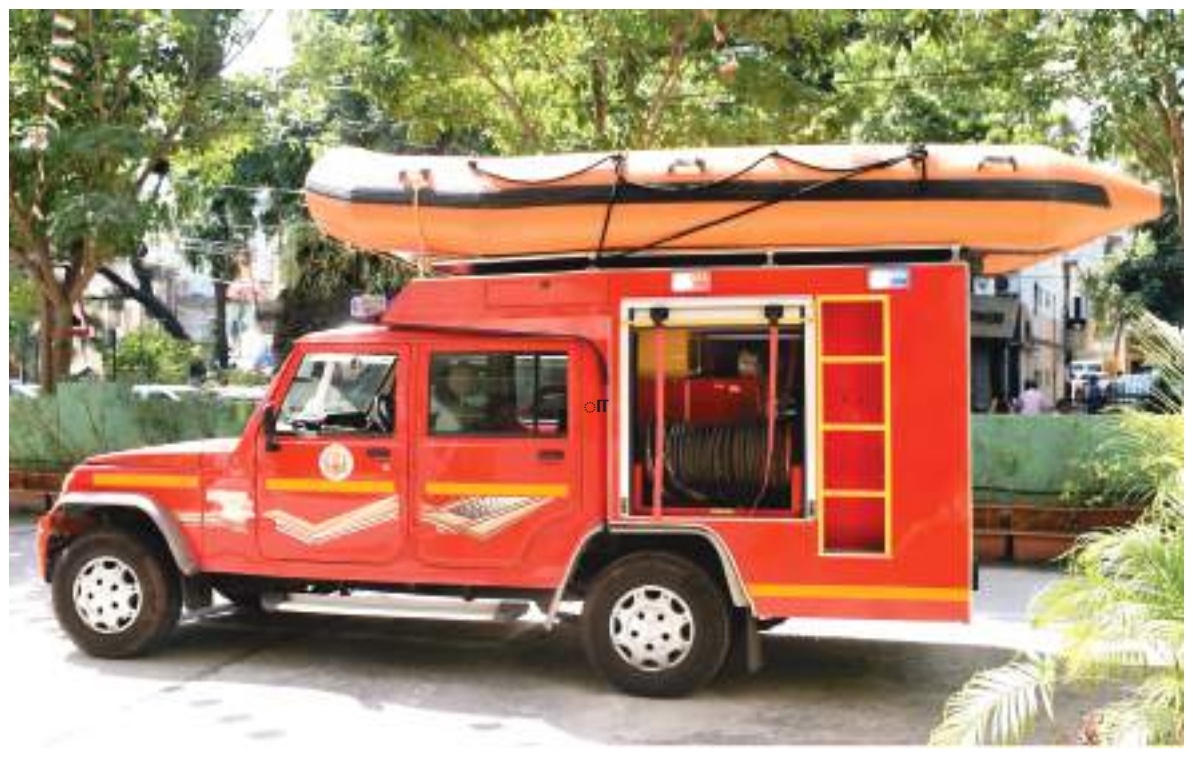
QUICK RESPONSE VEHICLE WITH INFLOATABLE RUBBER BOAT