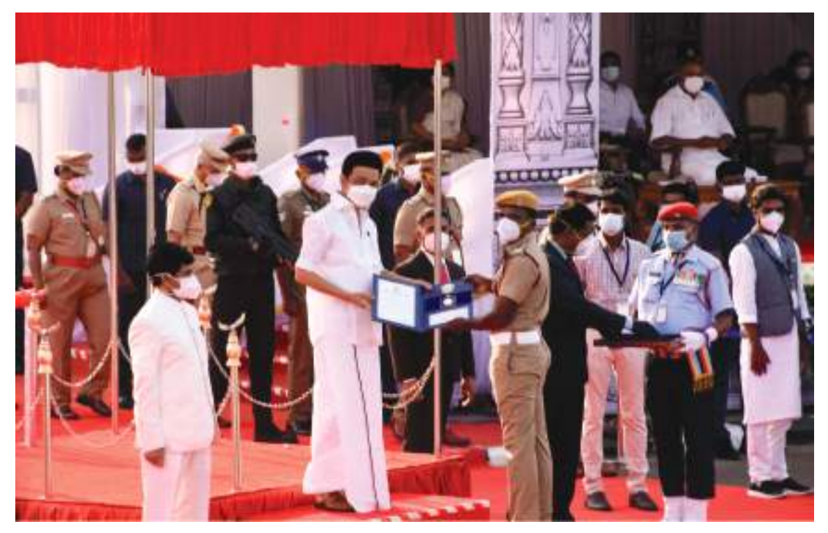
HON'BLE CHIEF MINISTER PRESENTED ANNA MEDAL TO THE FIREMAN