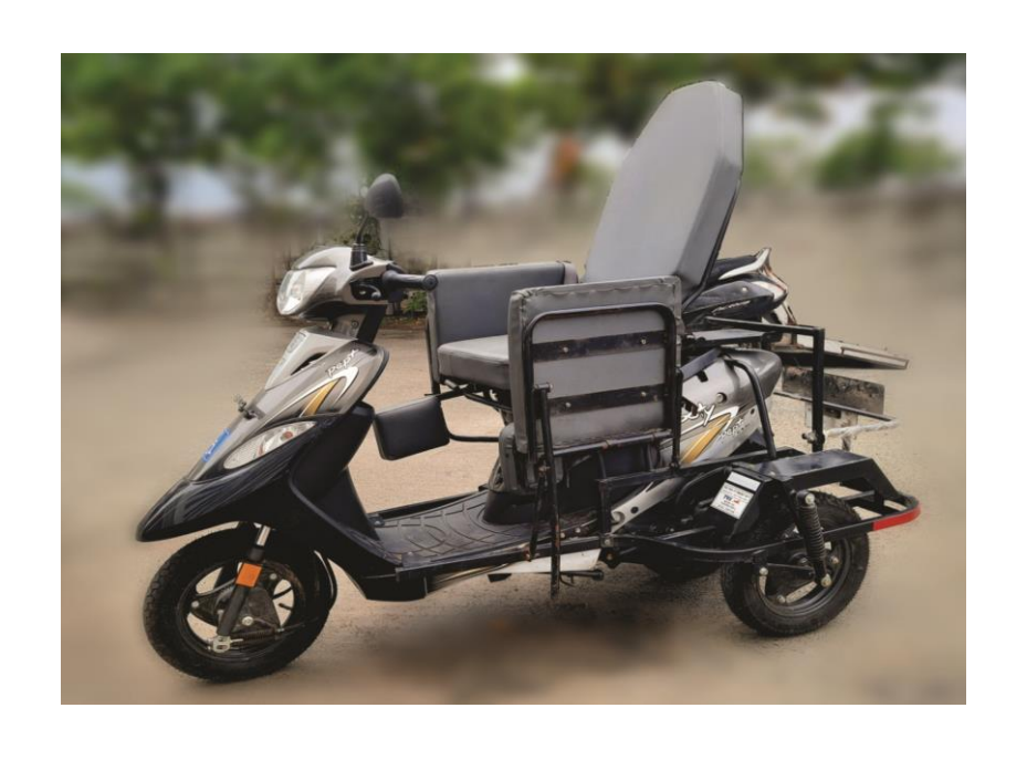
Specially Designed Retro-Fitted Petrol Scooter for Spinal Cord Injured Persons