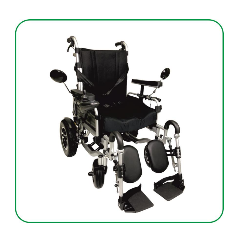
Battery Operated Wheel Chair