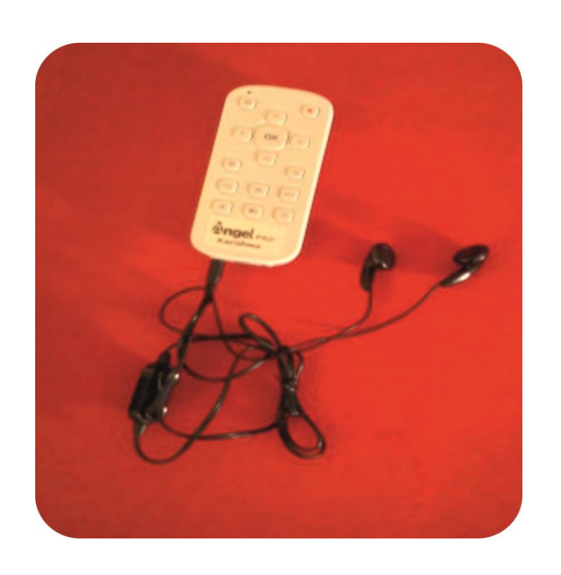
Angel-Pro Daisy Player