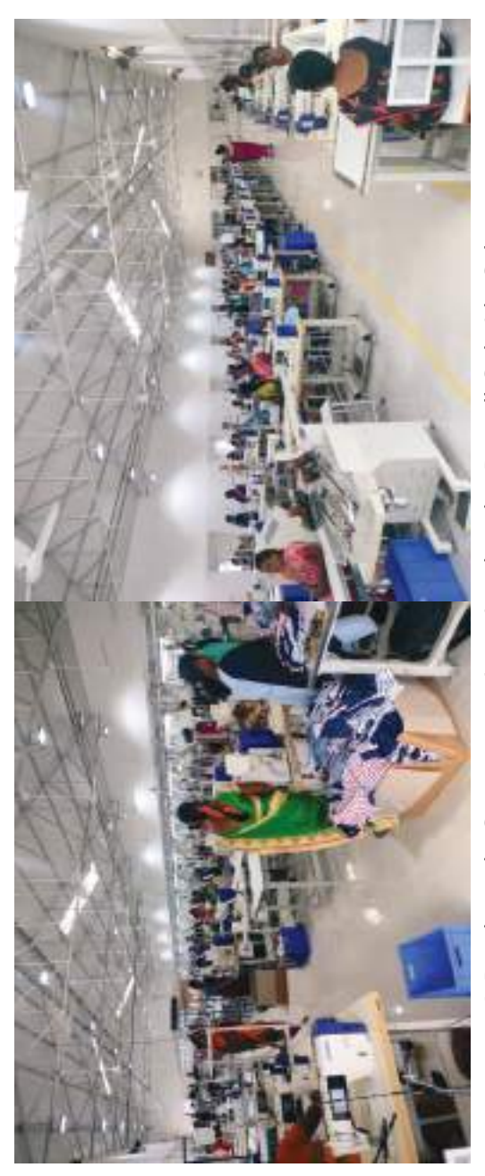
A Readymade Garments unit assisted under Payroll Subsidy Scheme, Kancheepuram District