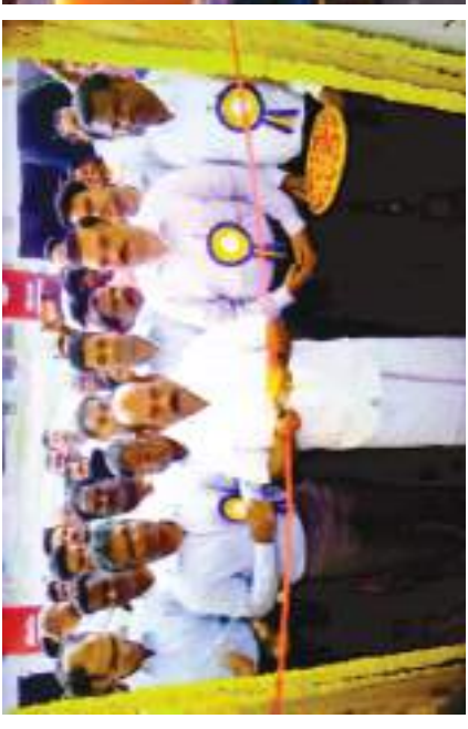
TANSI Showroom cum Sales Centre was inaugurated by the Hon'ble Minister for Micro, Small and Medium Enterprises on 8.2.2023 at Guindy in Chennai.