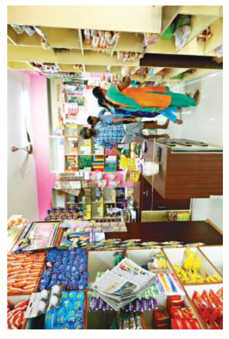
A Super Market unit assisted under UYEGP Scheme, Perambalur District