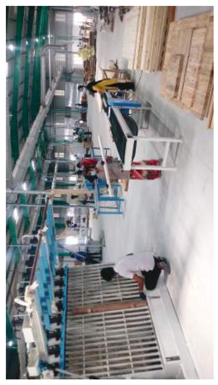
Wooden Furniture Cluster, Karumapuram, Salem district MSE-CDP Scheme Project Cost - Rs.1446.33 Lakh