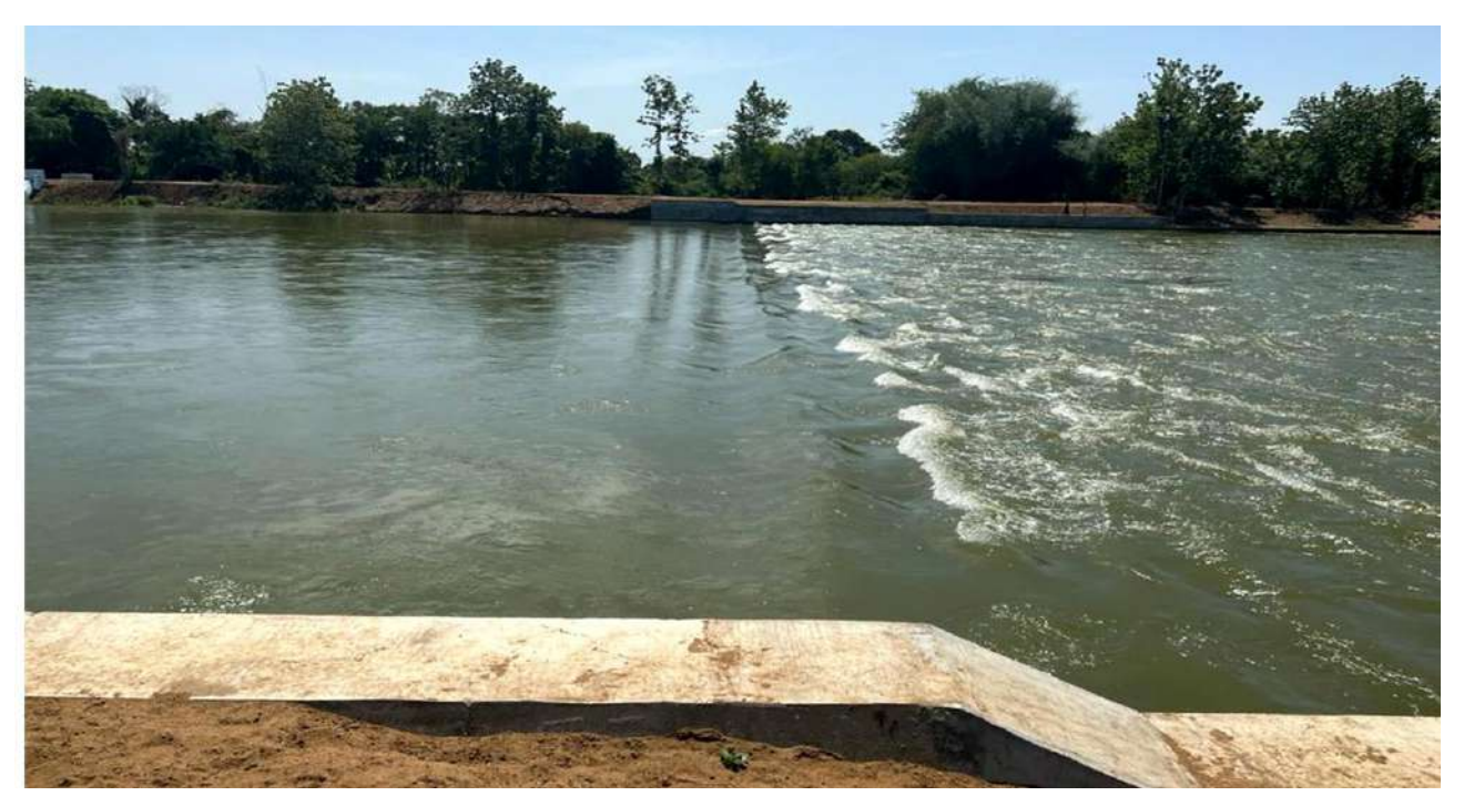
Thanjavur District - Grade wall across Vennar River at LS 85.180 Km in Ivelithottam Village – (Estimate Rs.5.856 crore) - NABARD