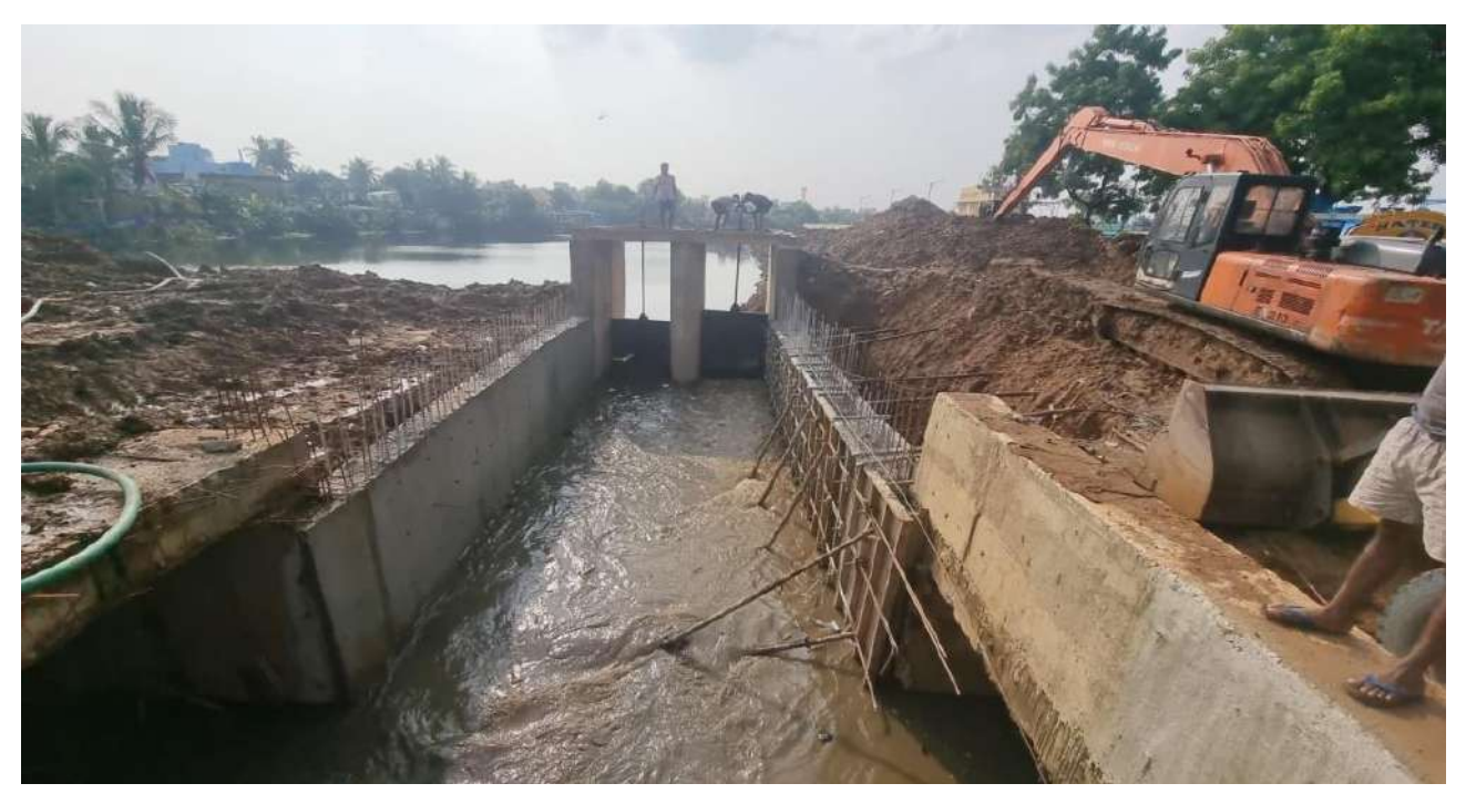
Chennai District- Restoration of bank and deepening of existing tank bed and improvements to its surplus course of Kolathur Tank - Estimate Amount Rs. 7.30 crore - State Fund