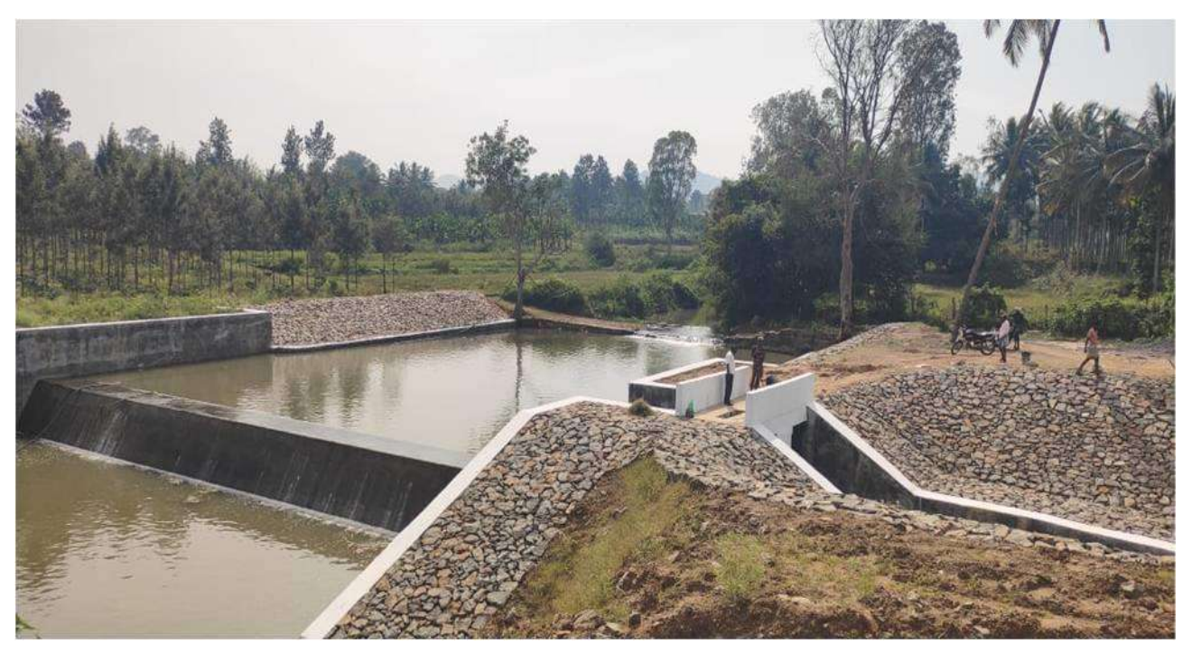
Salem District- Diversion of Kaikan Valavu Surplus Water to Kariyakoil reservoir (Estimate Rs.7.30 crore)- State Fund