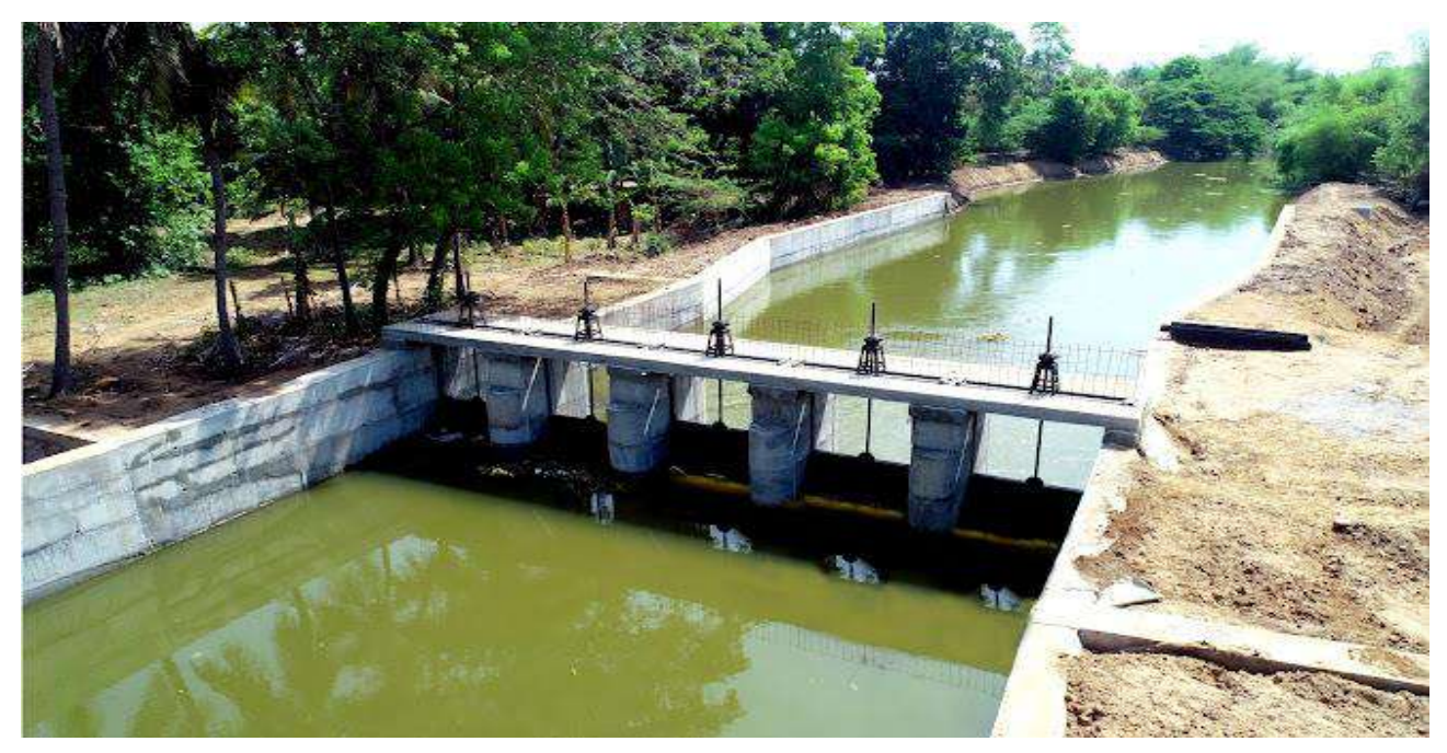
Mayiladuthurai, Thanjavur & Thiruvarur District- Extension, Renovation and Modernisation -Cauvery subbasin-Regulator across Keerthimanar River (Package No -21) – (Estimate Amount Rs.136.54 crore) - NIDA