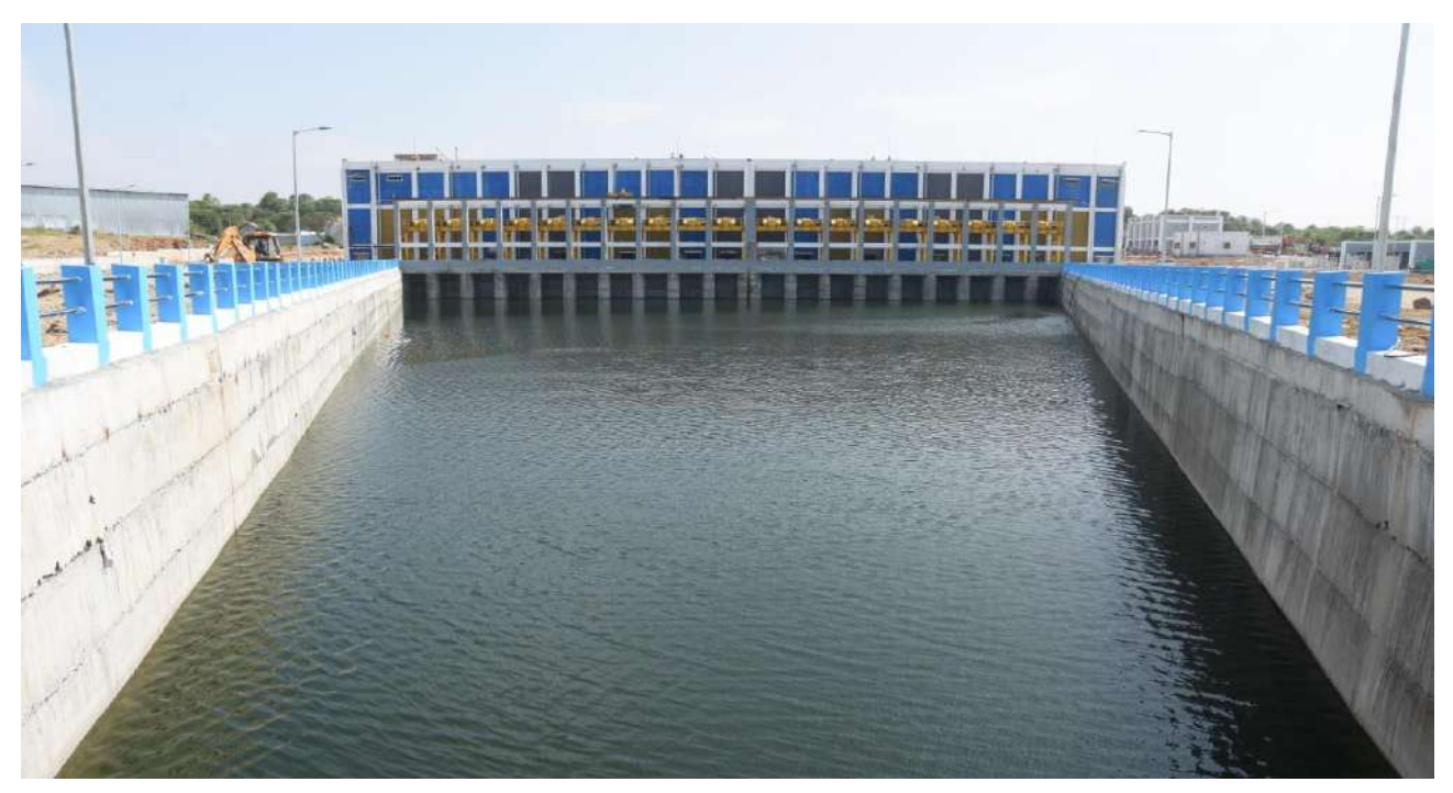
Salem District - Mettur Sarabanga Lift Irrigation Project Thippampatti Pumping Station – (Estimate Rs. 565.00 crore) – State Fund