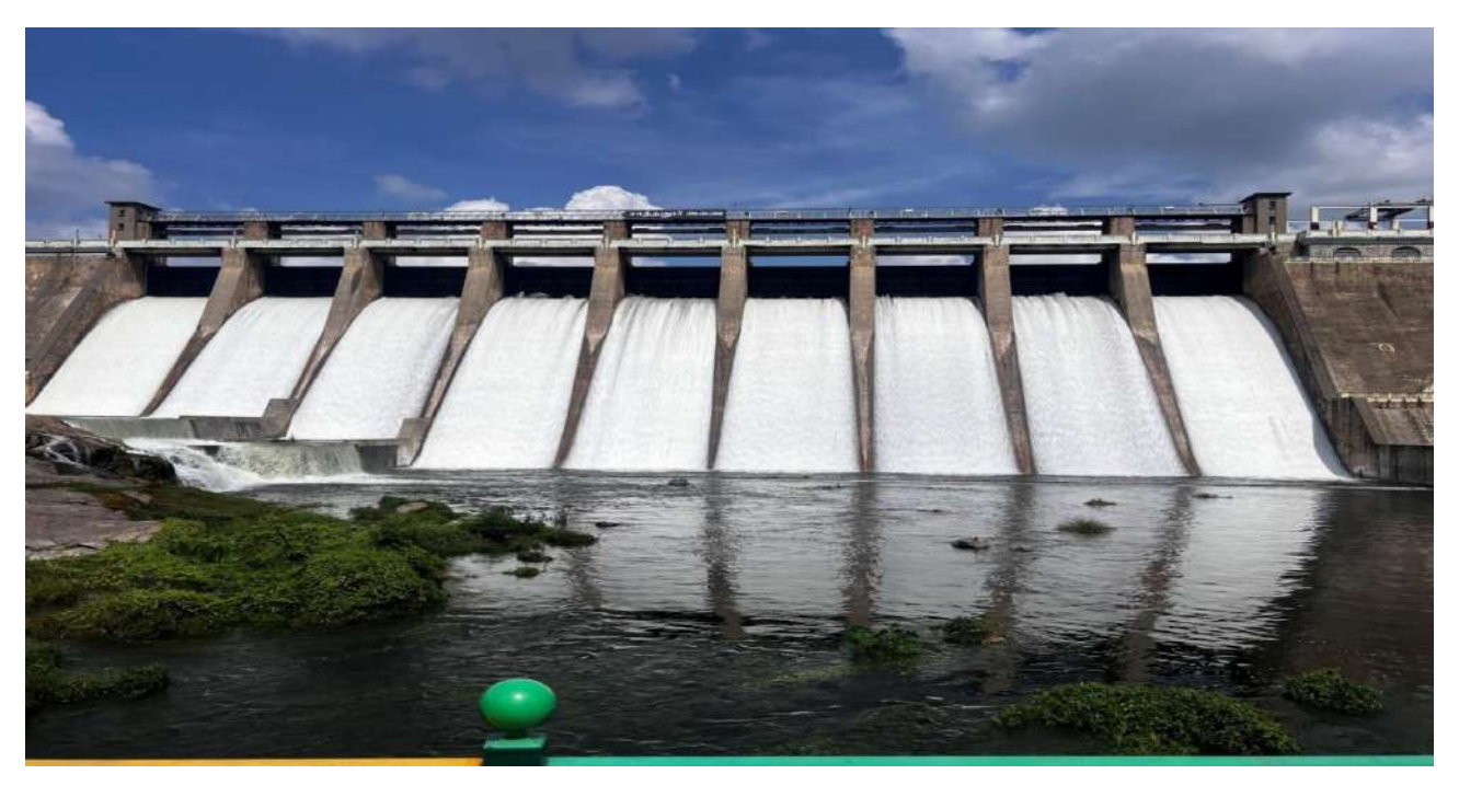
Thiruvannamalai District - Rehabilitaiton and Improvement to Sathanur Dam in Thandarampattu Taluk of Tiruvannamalai District- Estimate Amount Rs.90 crore- DRIP II.