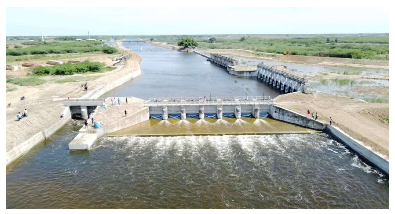
Ramanathapuram District - Additional Vents across the Supply Channel of Ramanathapuram Big Tank – Estimate Rs.9.93 crore - State Fund