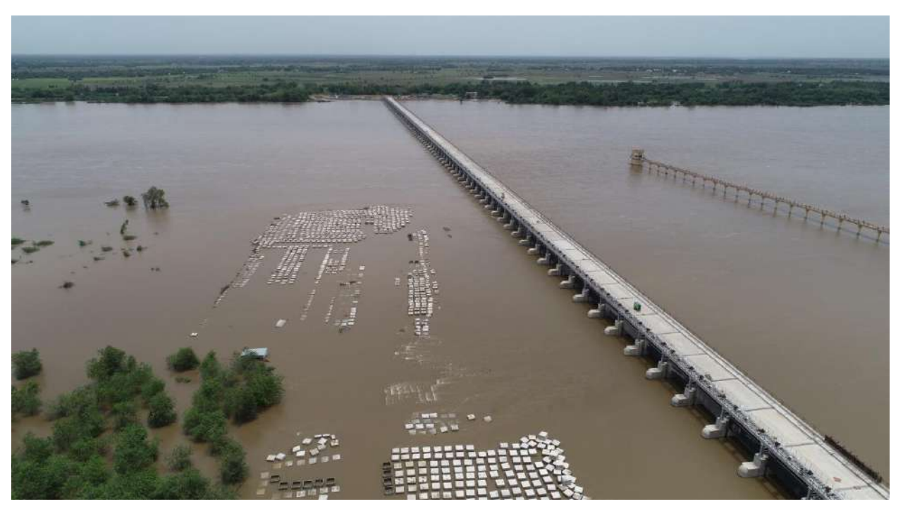
Cuddalore & Mayiladuthurai Districts- Construction of Barrage across River Coleroon in between Adhanur and Kumaramangalam villages - (Estimate Rs. 494.60 crore) – State Fund