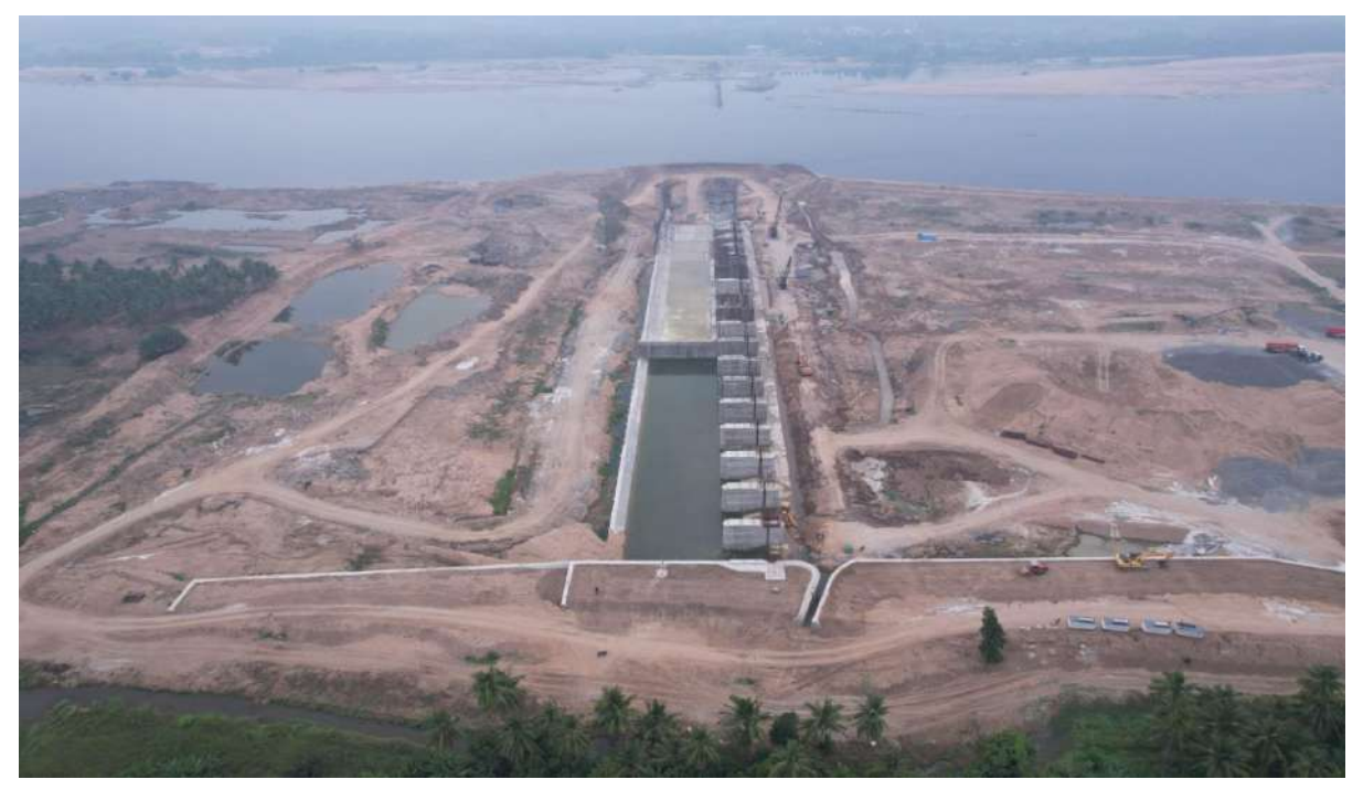
Karur District - Construction of Barrage across River Cauvery in Nanjai Pugalur village – (Estimate Rs. 406.50 crore)- NIDA