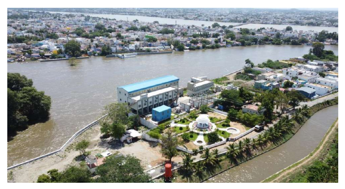
Erode District – Bhavani Taluk, Athikadavu Avinashi Pumping Scheme Pumping Station I at Bhavani– Estimate Amount Rs.1756.88 Crore – State Fund.