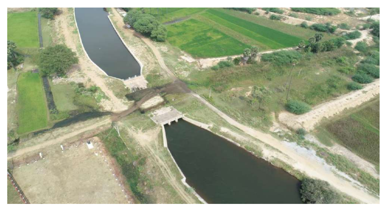
Erode, Tiruppur and Karur District- Extension, Renovation and Modernisation - Protection wall at Mile 64/2 in LBP Main canal (Package No -4) – (Estimate Amount Rs.189.55 crore) - NIDA