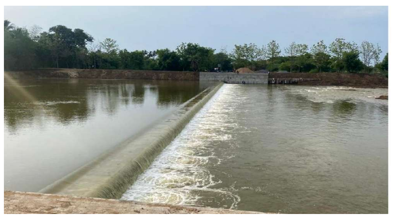
Thanjavur District - Grade wall across Vettar River at LS 73.635 Km in Surakkayur village - (Estimate Rs.4.88 crore) - NABARD