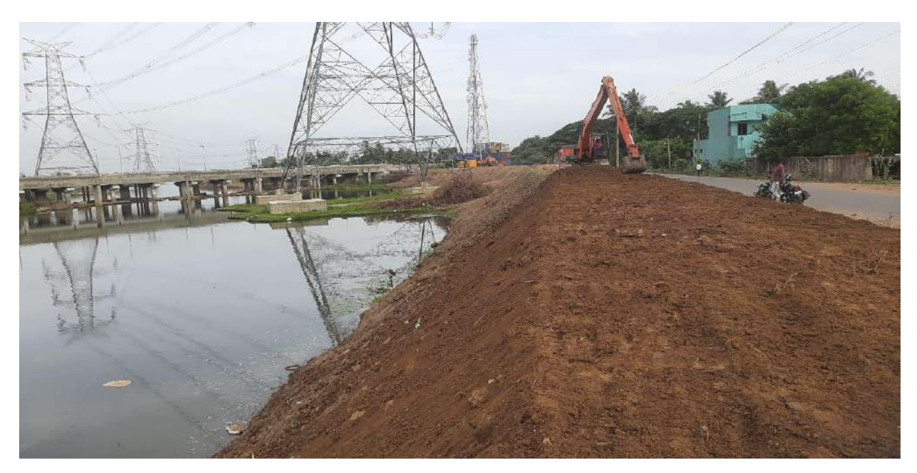
Thiruvallur and Chennai District- Restoration and Reformation of River Bund and regradation of River Bed in Kosasthalaiyar River - Estimate Amount Rs. 15.00 crore - State Fund