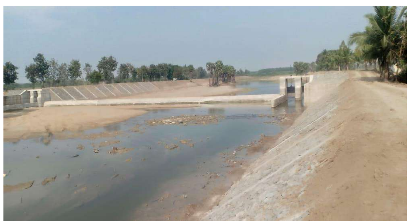
Villupuram District - Construction of Artificial Recharging Structure Across Nallavur River Near Kiliyanur Village in Vanur Taluk -Estimate Amount Rs. 3.91 crore - NABARD Fund