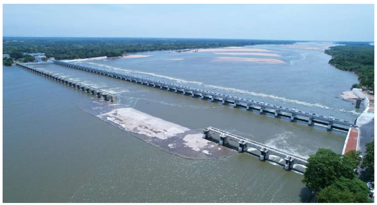
Trichy District - New Regulator across River Coleroon at Mukkombu- (Estimate Rs. 414.00 crore)- NABARD Fund