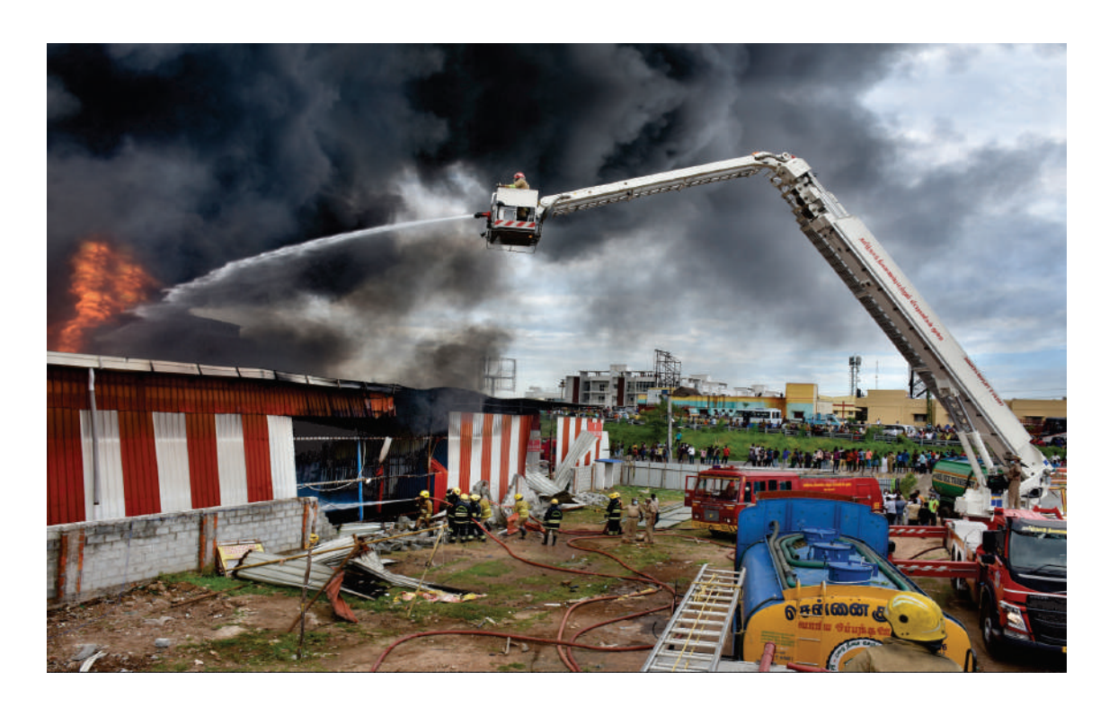
FIRE FIGHTING IN A FILM DECORATIONS WAREHOUSE