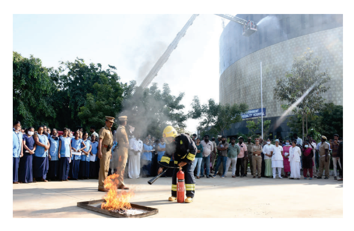
FIRE PREVENTION MOCK DRILL CONDUCTED IN MULTI SUPER SPECIALTY HOSPITAL