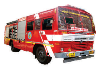
EMERGENCY RESCUE TENDER