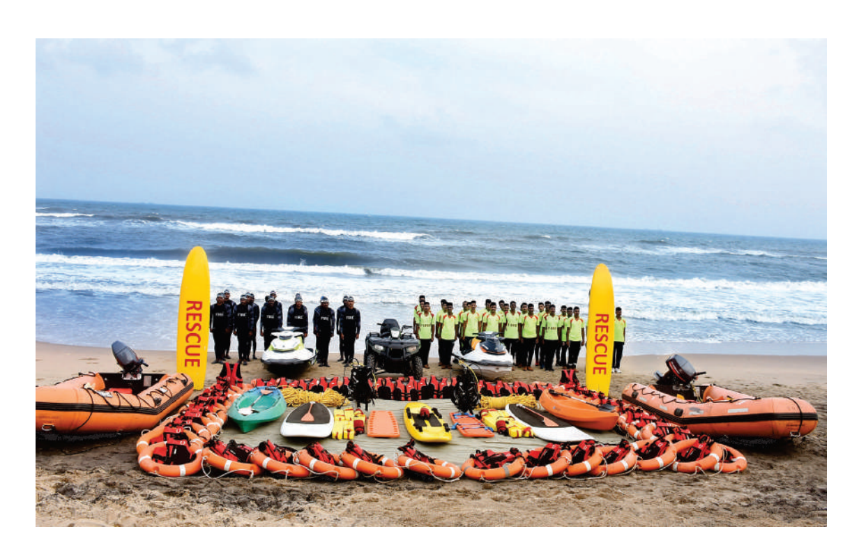
RESCUE TEAM - MARINA BEACH, CHENNAI