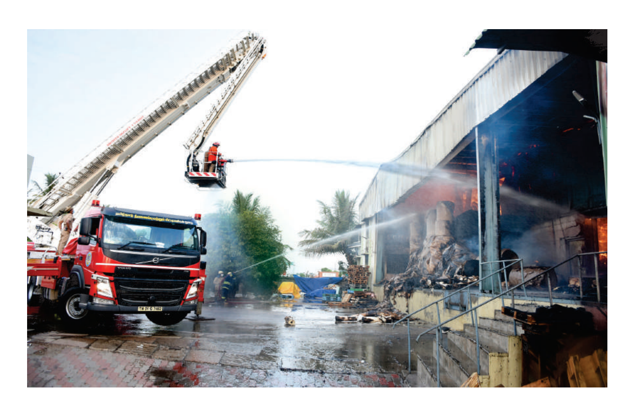
FIRE FIGHTING IN A PAPER GODOWN