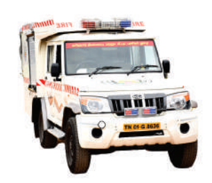
QUICK RESPONSE VEHICLE