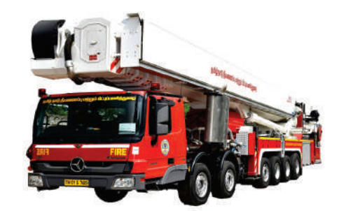
AERIAL LADDER PLATFORM