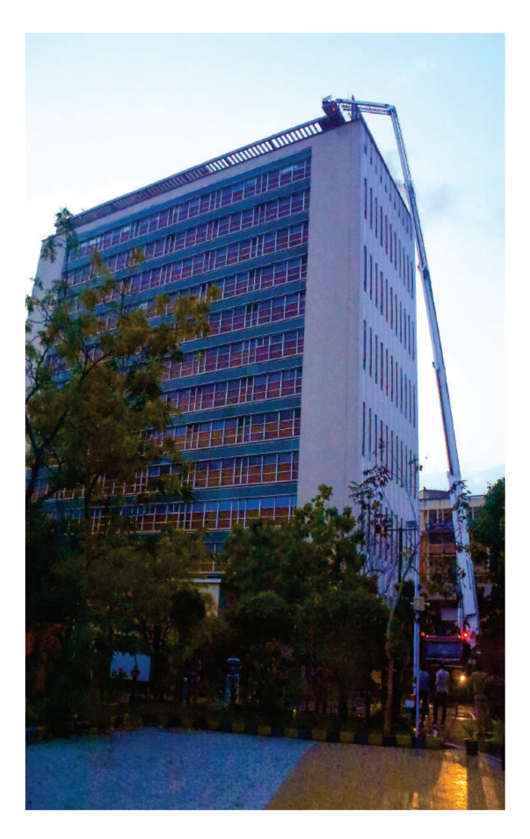
FIRE FIGHTING IN LIC BUILDING